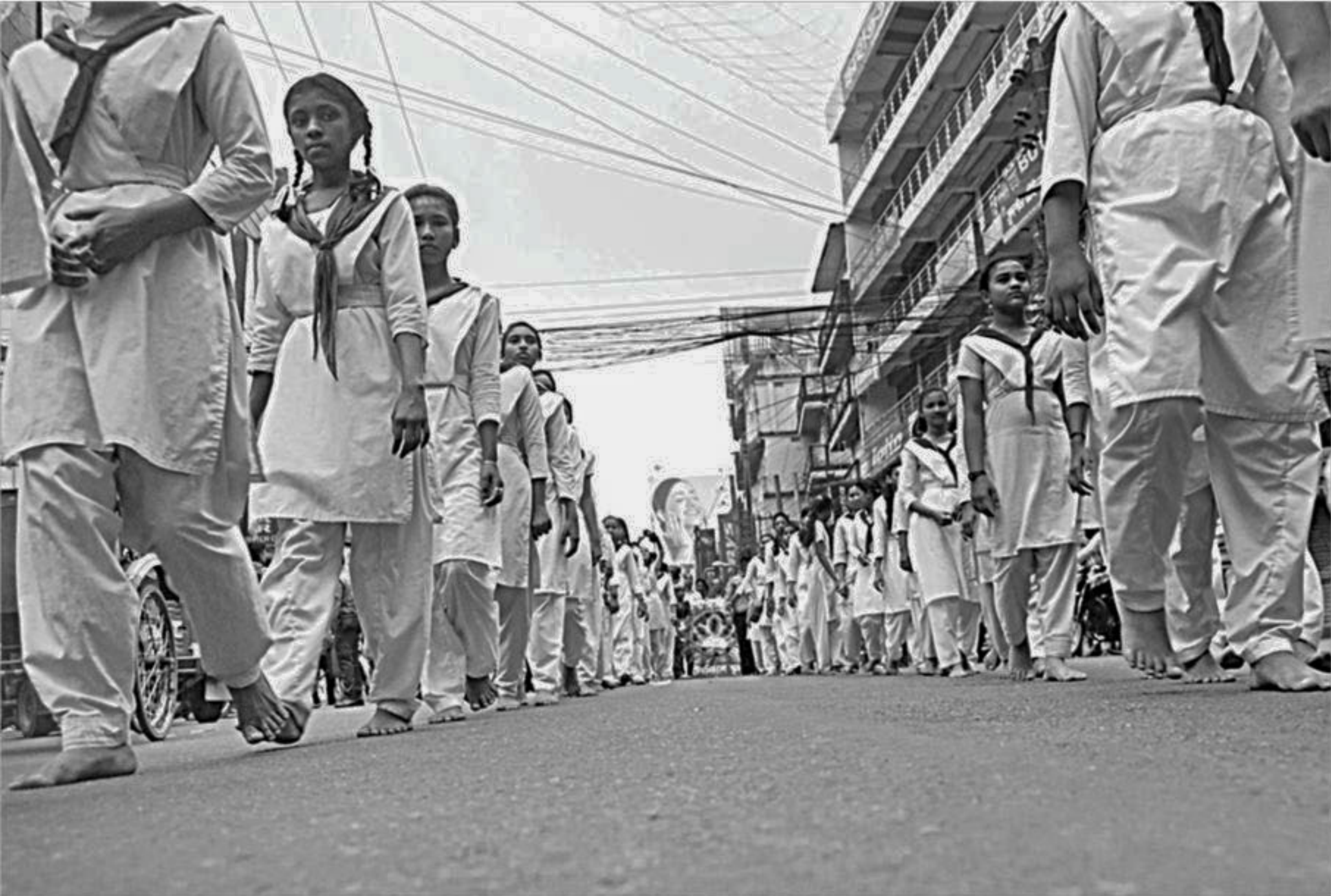
Sammlita Natya Parishad, Sylhet, brings out a barefoot procession at dawn yesterday in the city, marking International Mother Language Day.

The book is available at stall no. 281 and 282 of APPL at the fair.