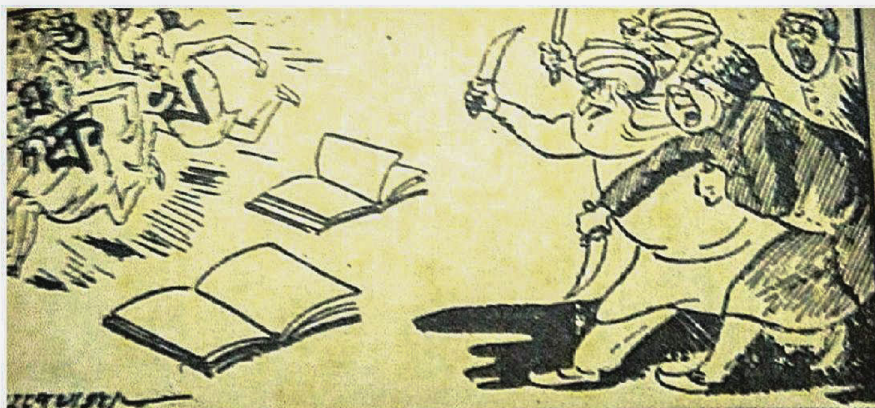
A caricature by cartoonist Kazi Abul Kasem