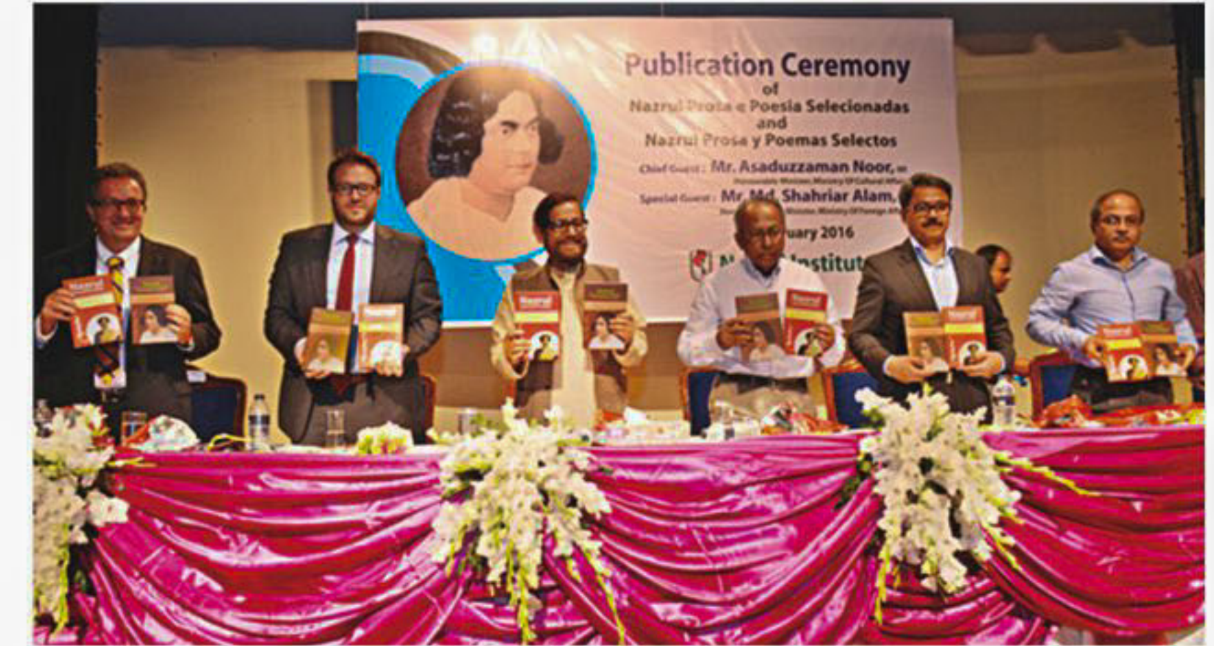
Guests at the book launch ceremony.

and tigers and crocodiles of the Sunderbans from going from one side to the other. It is a history of the humans which we can never do away with," he said. After "Padma Nadir Majhi", which stars actors of India and Bangladesh, and "Moner Manush", "Sangkhachil", which was shot in locations in both the countries, is Ghose's third Indo-Bangla production. About the popularity of Prosenjit in Bangladesh, Ghose said "He is immensely popular in Bangladesh. I had seen this during the shoot of "Moner Manush" and found it again during the shoot of "Sangkhachil". At times, we forgot where were shooting in West Bengal or Bangladesh." For his part, Prosenjit recalled how during the journey from the hotel to the shooting location early morning, he would come out of the car at seven-eight places to meet fans of all ages, including elderly village women, and parrot a few lines from his hit films. "At such times, the geographical barriers cease to exist. I feel honoured," said Prosenjit, who is co-producing the film with a Bangladeshi producer. "We have also sent the film to Cannes and it will visit several other premier festivals," he said.