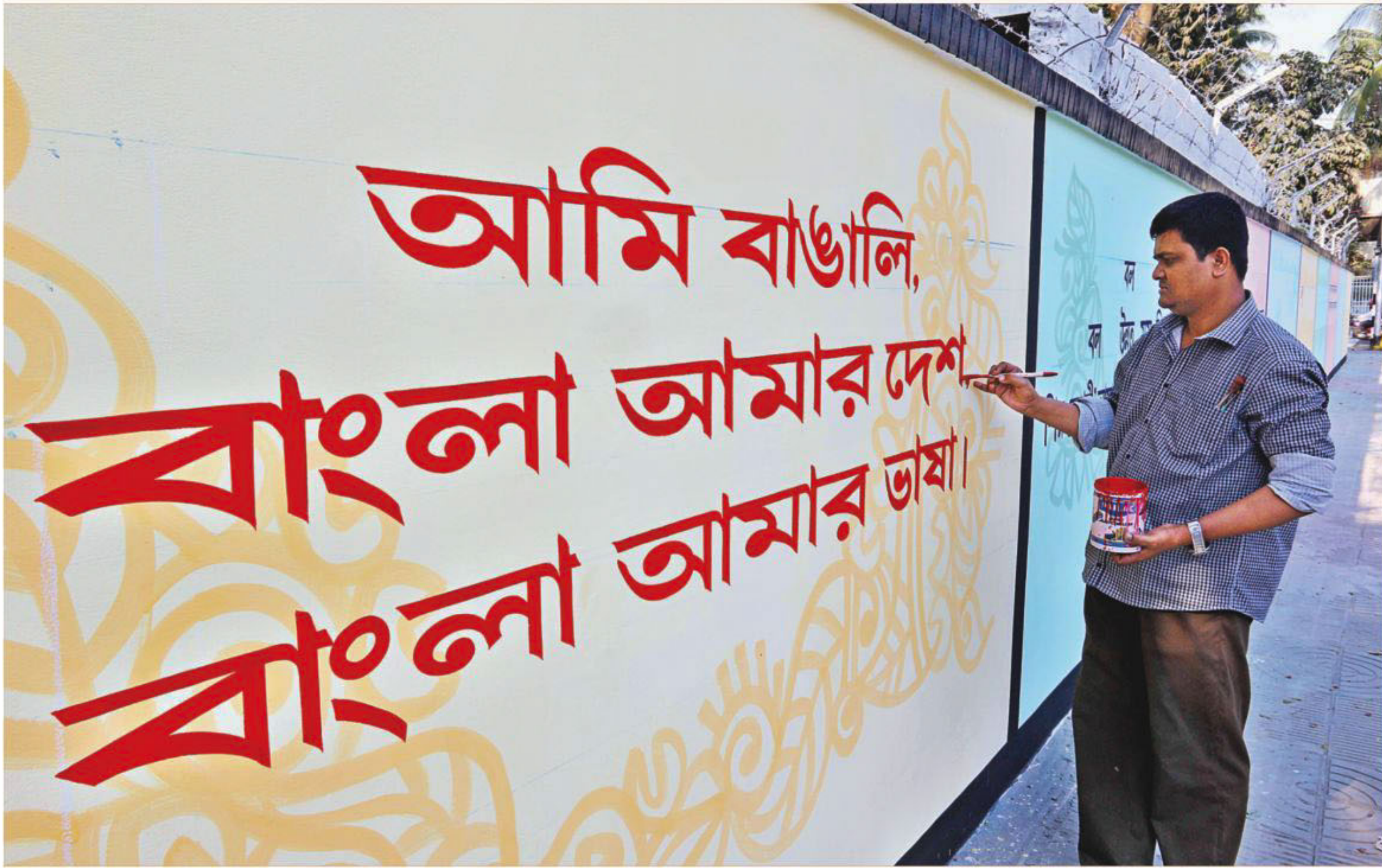
A student of the Faculty of Fine Arts of Dhaka University writes, "I am a Bangalee, Bangla is my country, Bangla is my language", on a wall near the Central Shaheed Minar in the capital yesterday ahead of International Mother Language Day on February 21.

They left for Dhaka from Kolkata Press Club by riding bicycles and running on February 14, and placed wreaths at the Central Shaheed Minar of Jessore, Magura, and Faridpur, along their journey.