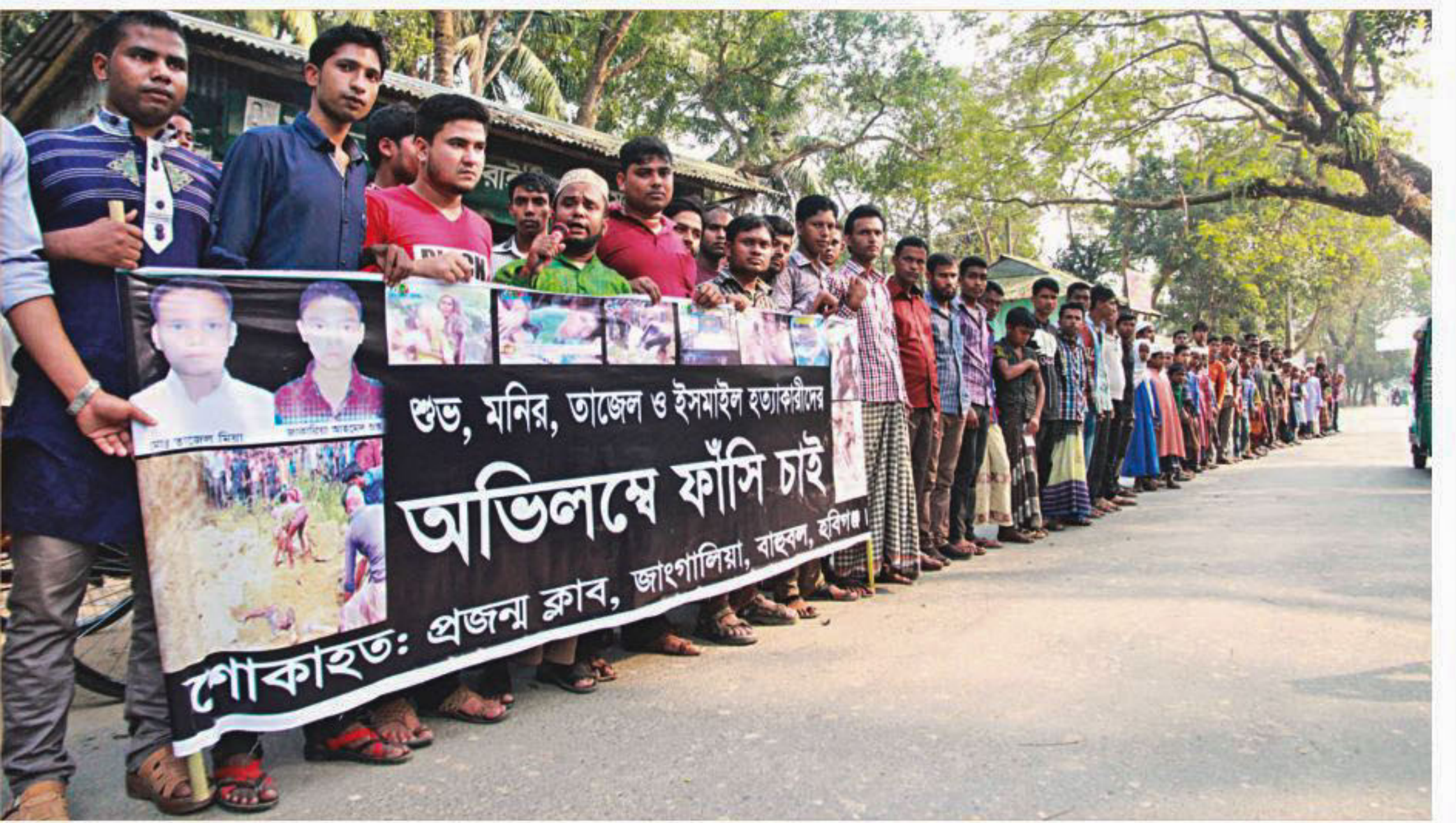
Locals under the banner of Prajanma Club form a human chain yesterday to protest the recent abductions and brutal killings of four school students in Bahubal upazila of Habiganj.