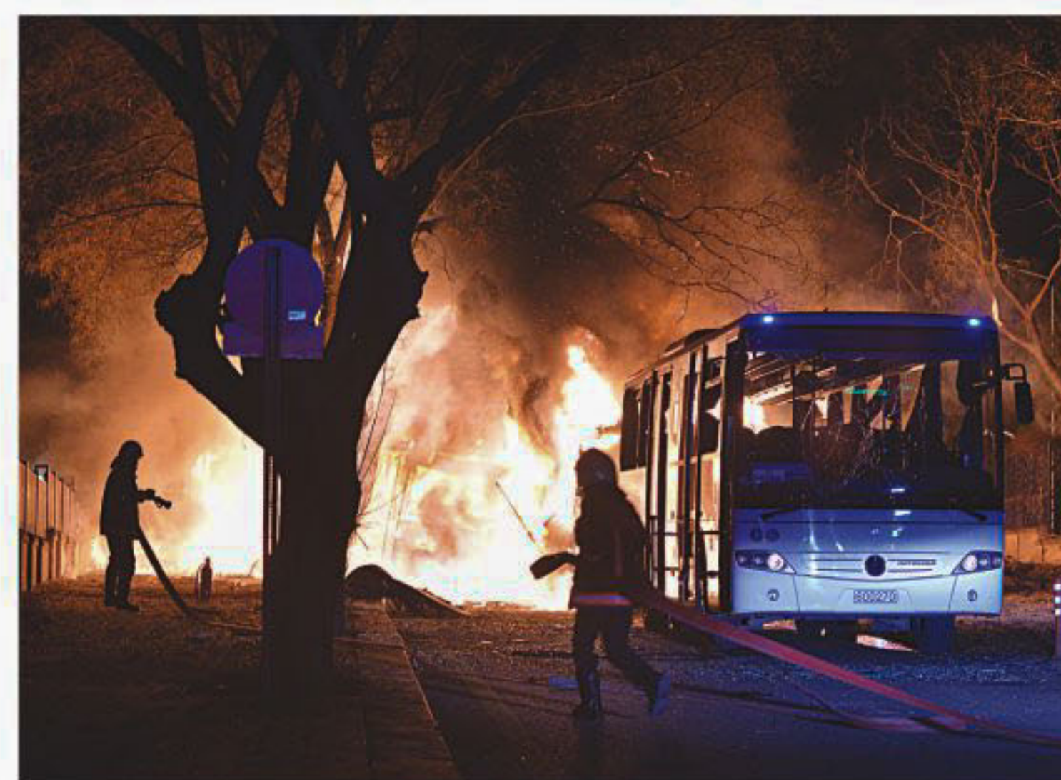
Firefighters try to extinguish flames following an explosion after an attack targeted military service vehicles in Ankara yesterday.

The powerful blast was heard all over the city, sending residents to their balconies in panic, an AFP correspondent said.