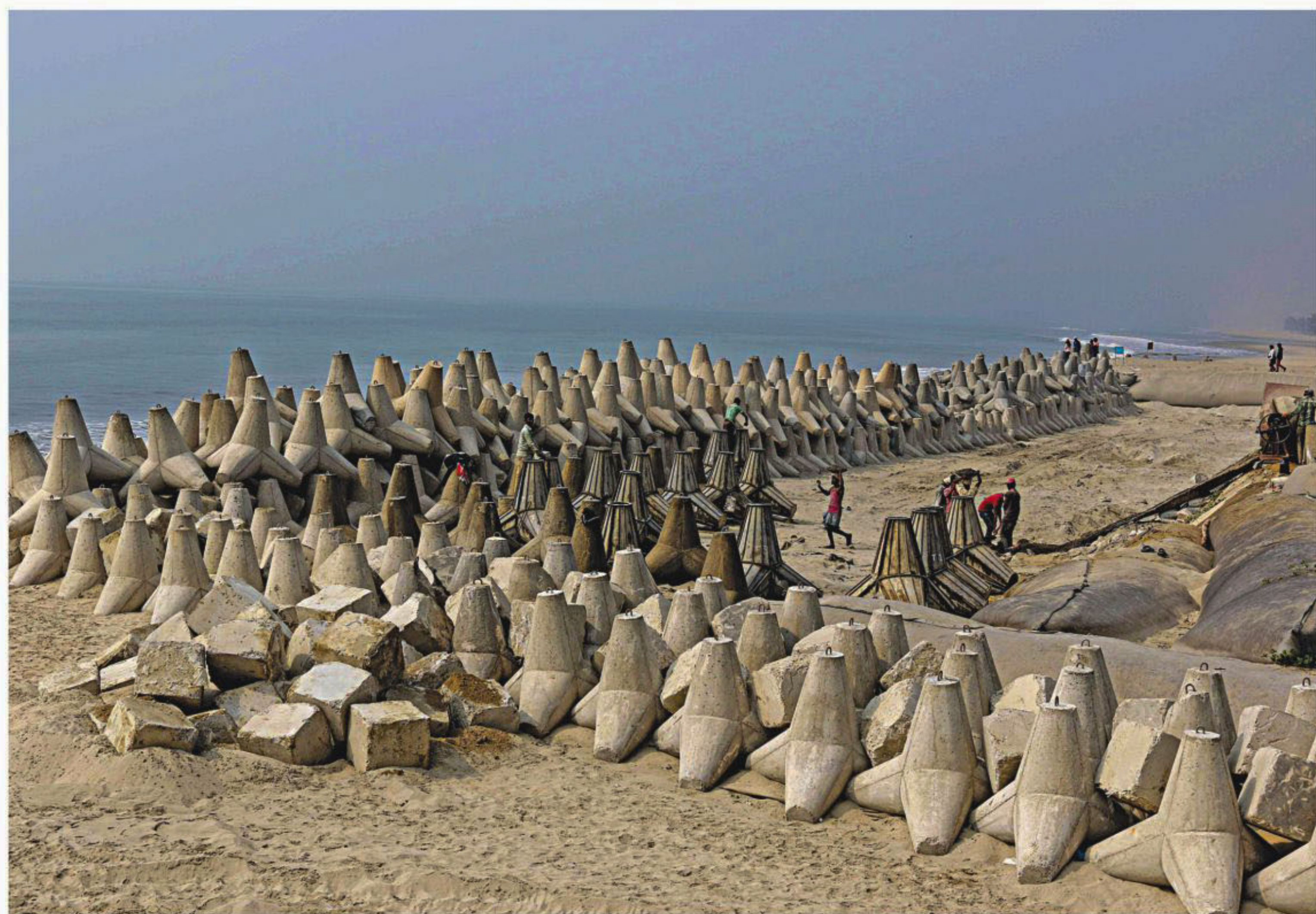
Concrete tetra pods on a beach near the army camp on Marine Drive Road in Cox's Bazar. After constructing the road, Bangladesh Army is now placing the pods and geo tube sandbags along the road to protect it from strong waves. The photo was taken earlier this month.

Of the arrestees, four are from Kushtia. They are -- regional commander Sazzadul Alam alias Mukti Sir, a mathematics teacher of Lahini High School in Kushtia; Mejbahur