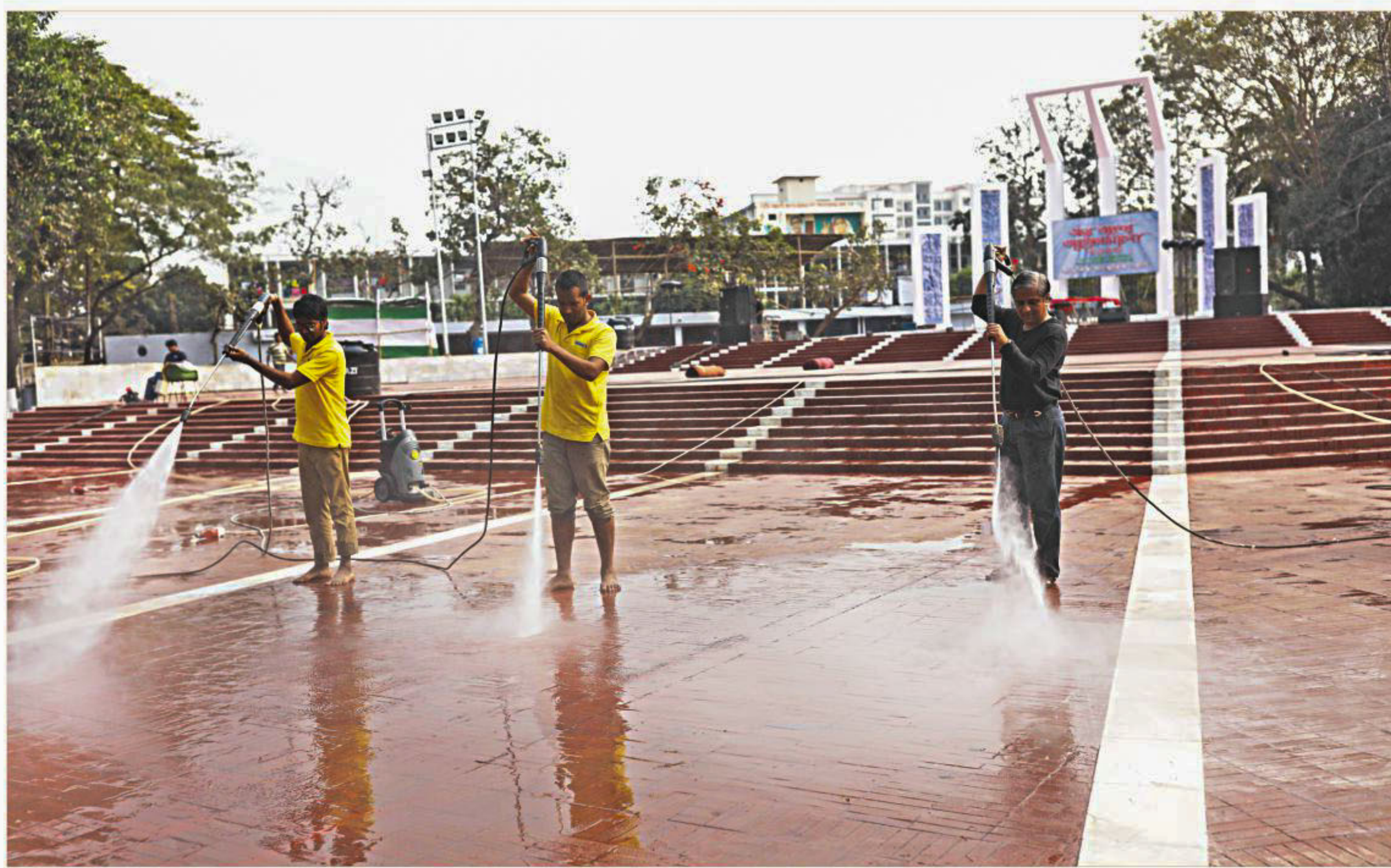
Central Shaheed Minar in the capital being hosed down with high pressured water yesterday and primed up for February 21 or Language Movement Day under a corporate social responsibility initiative of Greenland Technologies Limited, working on behalf of Dhaka University.