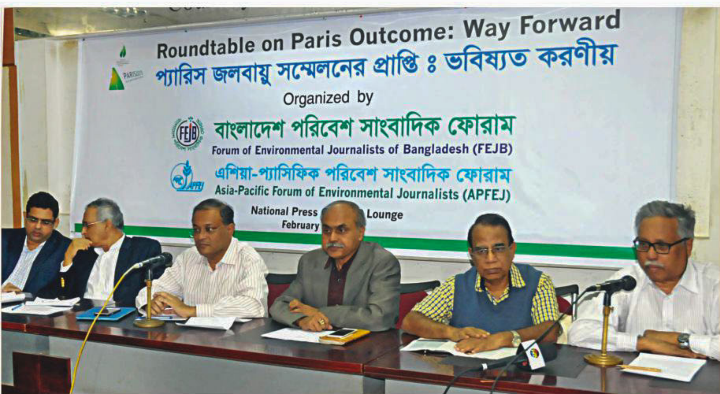
Participants at a roundtable on "Paris Outcome: Way Forward", organised by the Forum of Environmental Journalists of Bangladesh and the Asia-Pacific Forum of Environmental Journalists, at the capital's Jatiya Press Club yesterday.