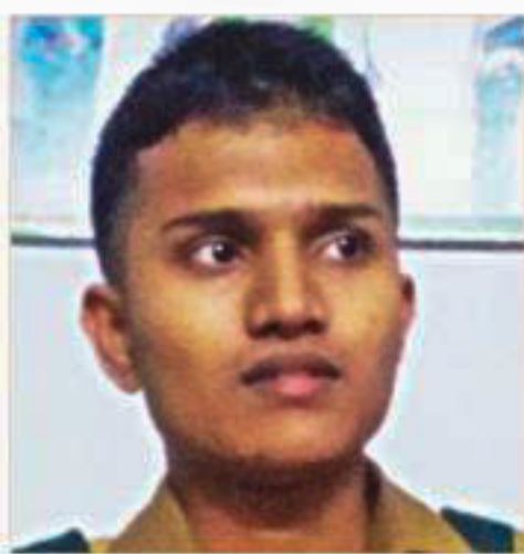
Appeal for help STAFF CORRESPONDENT

Police used a bailable section and not ones for abduction and grievous injury, she added.