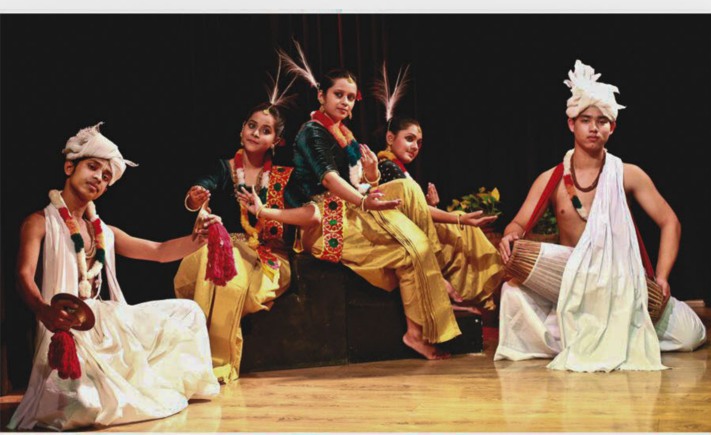
Shadhona dancers perform at the dance drama.