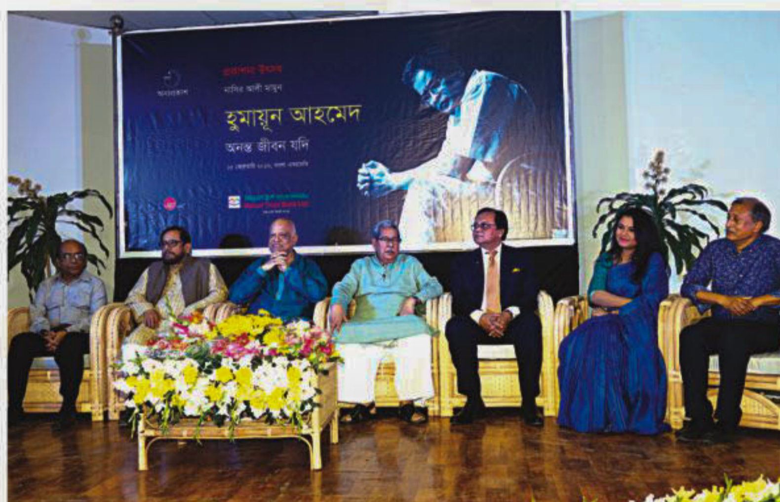
Distinguished guests at the book launch.