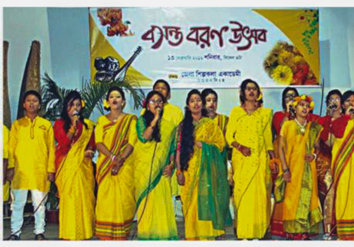
Artistes render a chorus.