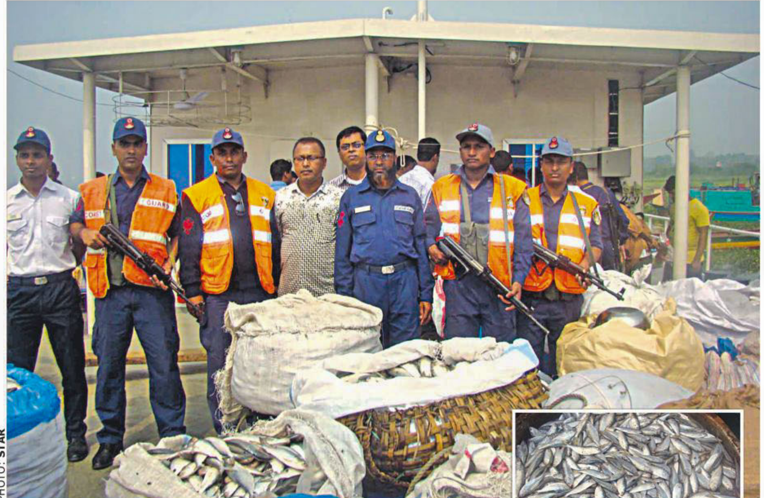
The fisheries department with the help of the coastguard seizes 500 maunds of jatka (hilsa fry less than ten inches long), inset, from a launch on the Meghna River in Gazaria upazila of Munshiganj yesterday.