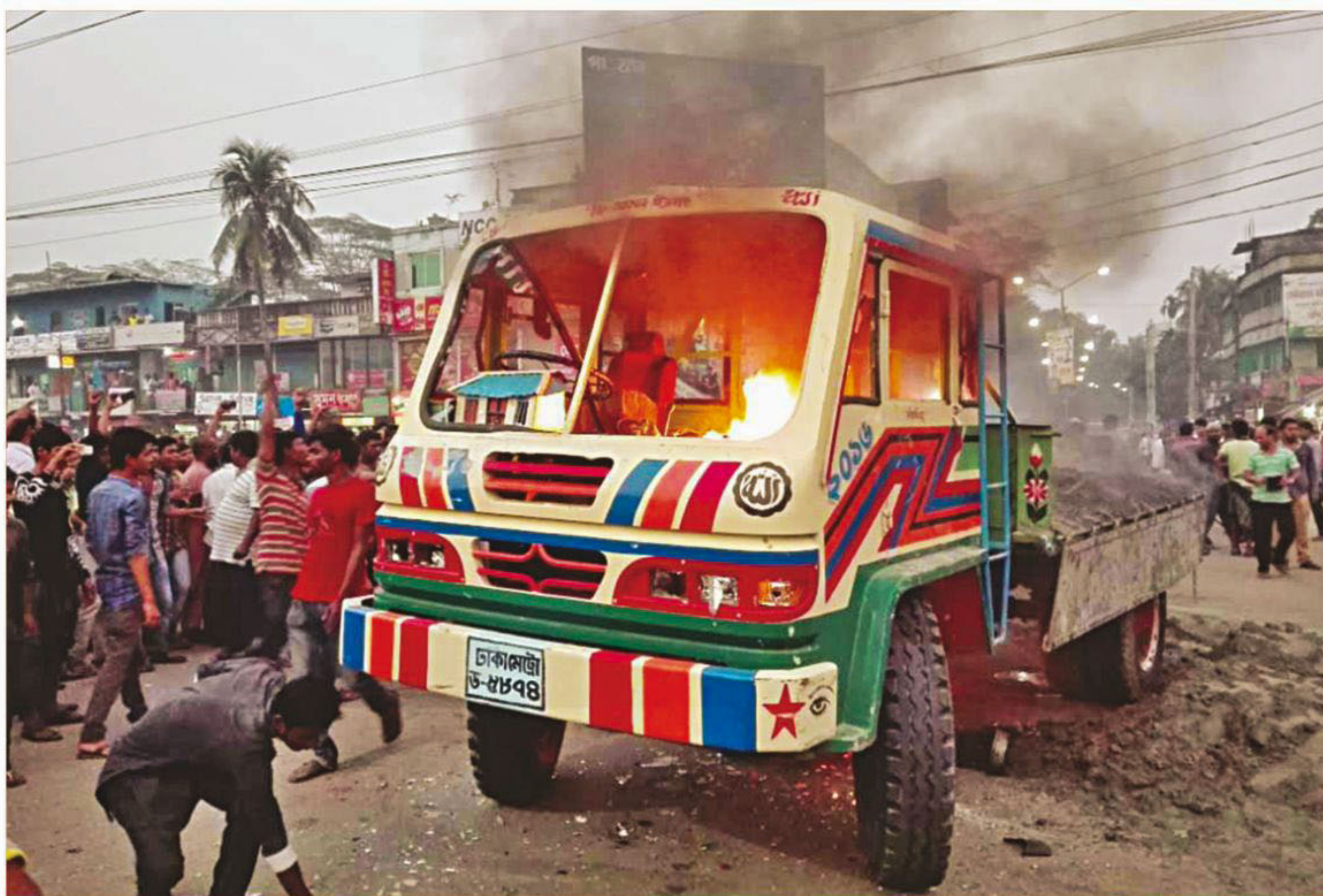
Agitated locals set fire to a truck and block road for an hour halting vehicular movements after it rammed a motorcycle on C and B Road in Nabagram Chowmatha area in Barisal city yesterday, killing the rider and leaving his co-rider critically injured. Meanwhile, in Gaibandha, thirty people were injured when a bridal party bus plunged into a roadside ditch due to dense fog at Beradanga on Gaibandha-Sunderganj road.

When the students of the dormitories protested the drug-taking incident, SEE PAGE 10 COL 1