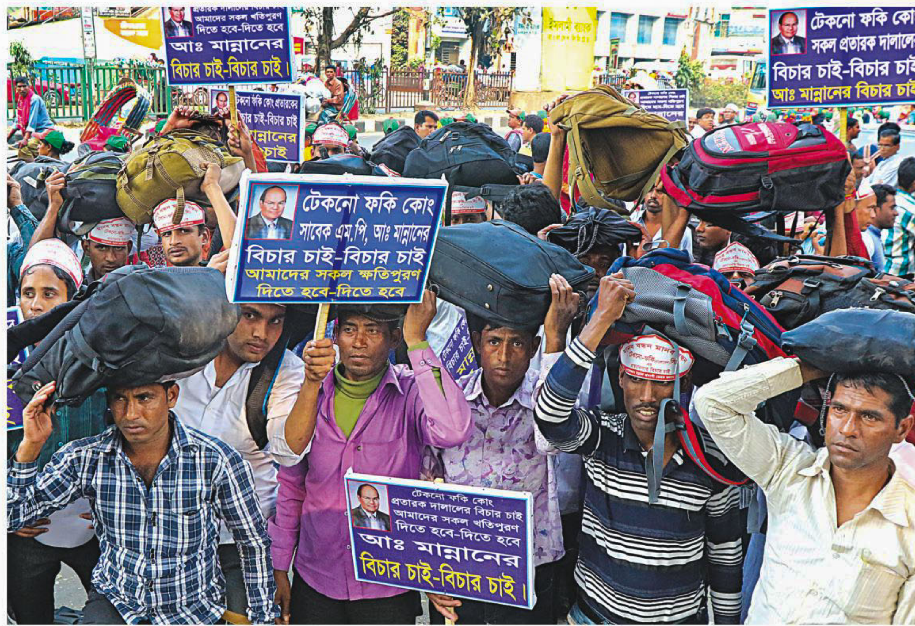
In a unique form of protest against a local recruiting agency, a group of migrant workers, who were forced to return home from Iraq recently, took to the streets, holding bags on their heads. They demand compensation from the agency and arrest of its owner and officials. The photo was taken in front of the Jatiya Press Club yesterday.