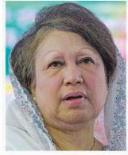
SEE PAGE 10 COL 2