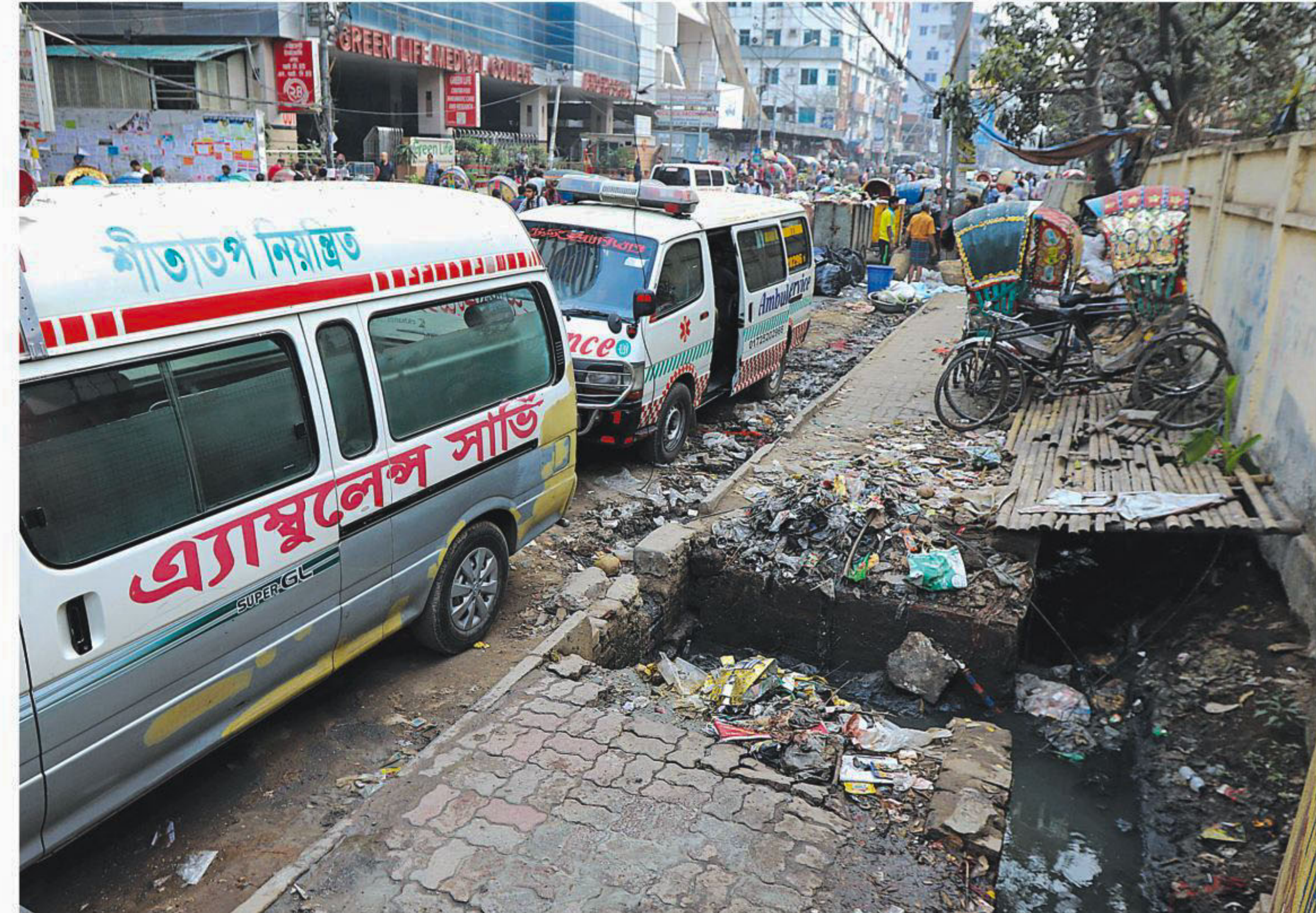
A part of a pavement on Green Road in the capital has been left in a dismal state for the last few months, making it impossible for pedestrians to cross it. The photo was taken recently.

COURT CORRESPONDENT Mahmudur Rahman, acting editor of Bangla daily Amar Desh, was shown arrested in a bomb blast case yesterday, a day after the Supreme Court upheld a High Court bail granted to him in a sedition case. The former energy adviser to a BNP government was expecting to be released from jail as he secured bail in all 74 criminal cases filed against him with police stations and courts across the country since December 2012. Meanwhile, BNP Joint Secretary General Rizvi Ahmed yesterday alleged that the government was creating barriers to the release of Mahmudur. The BNP leader sought intervention from Chief Justice Surendra Kumar Sinha for his immediate release. Earlier in the day, Metropolitan Magistrate Golam Nabi accepted a SEE PAGE 10 COL 4