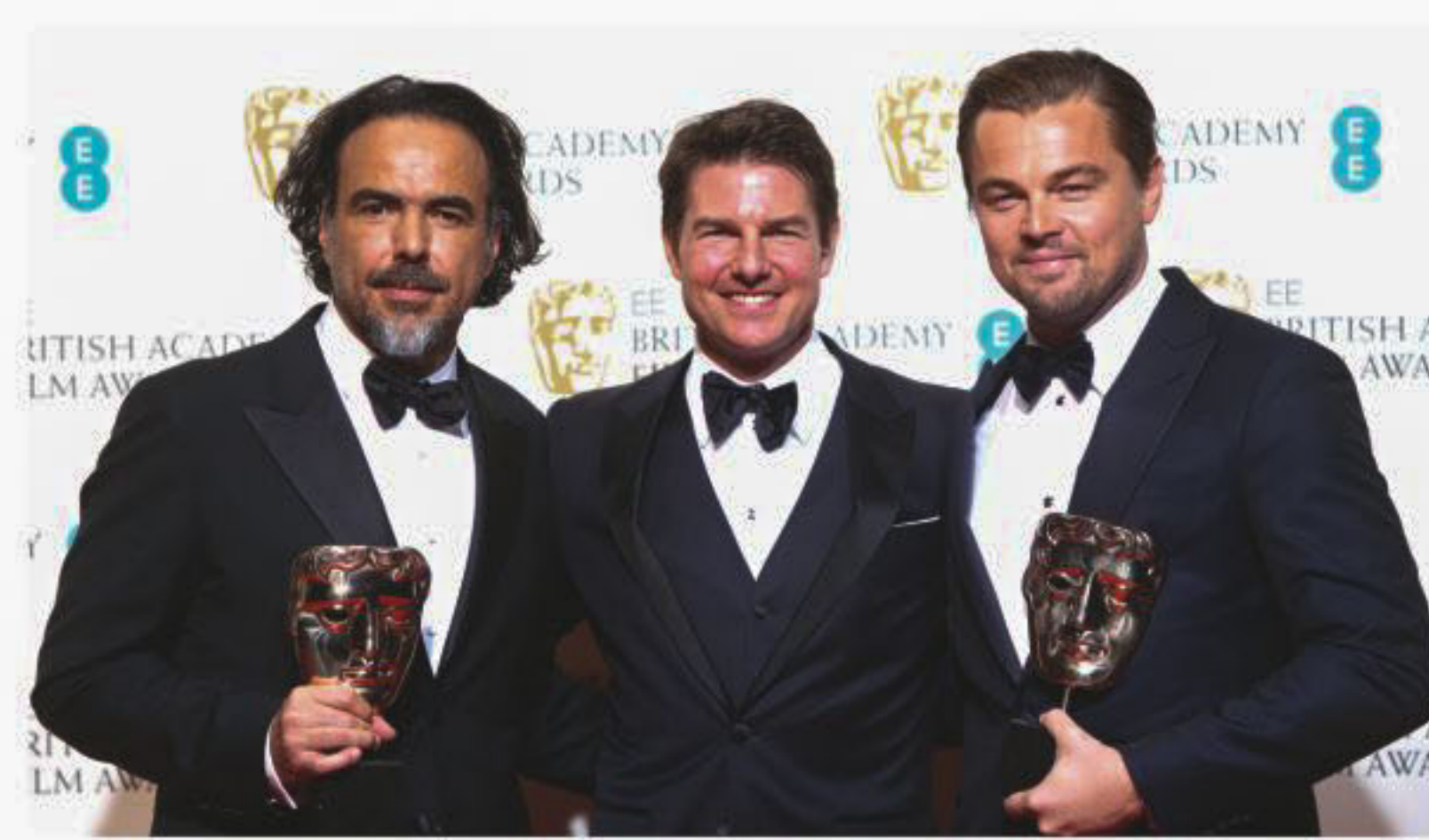
Award presenter Tom Cruise is flanked by winners Inarritu (L) and Leo.

Alejandro G. Inarritu's "The Revenant" came up trumps at the 69th British Academy Film Awards on Sunday night, nabbing five prizes including best film, director and leading actor. George Miller's "Mad Max: Fury Road" left the field with four BAFTAs - all in the more technical fields - including costume design, production design, makeup and hair and editing.