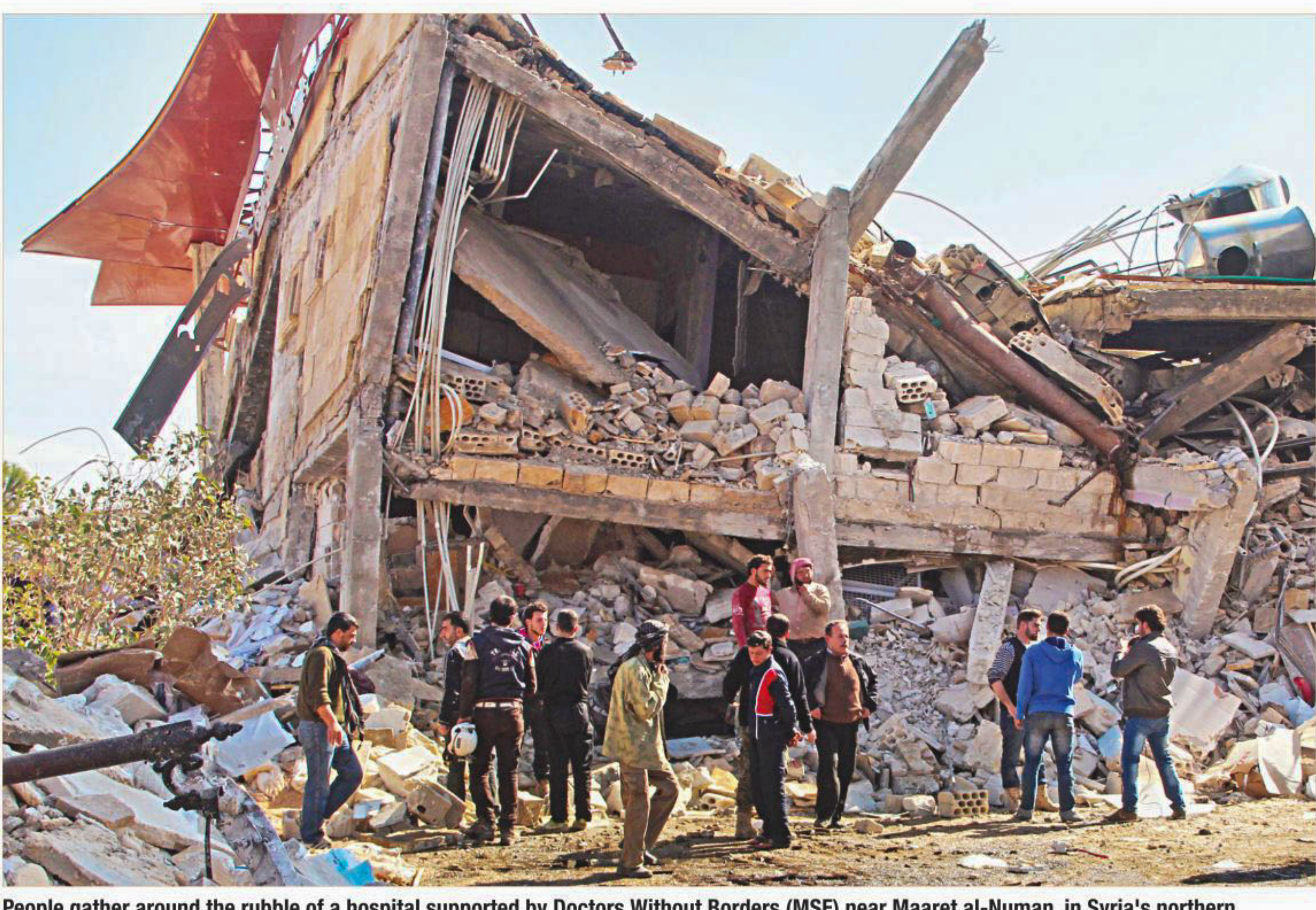
People gather around the rubble of a hospital supported by Doctors Without Borders (MSF) near Maaret al-Numan, in Syria's northern province of Idlib, yesterday, after the building was hit by suspected Russian air strikes. MSF confirmed in a statement that a hospital supported by the aid group in Idlib province was "destroyed in air strikes".

AFP, Dubai Bahraini authorities have arrested four Americans, including journalists, during protests marking the fifth anniversary of a Shia-led uprising in the kingdom, police said yesterday. "We are aware of reports that US citizens have been arrested (in Bahrain). We have no comment due to privacy considerations," a State Department spokesperson said.