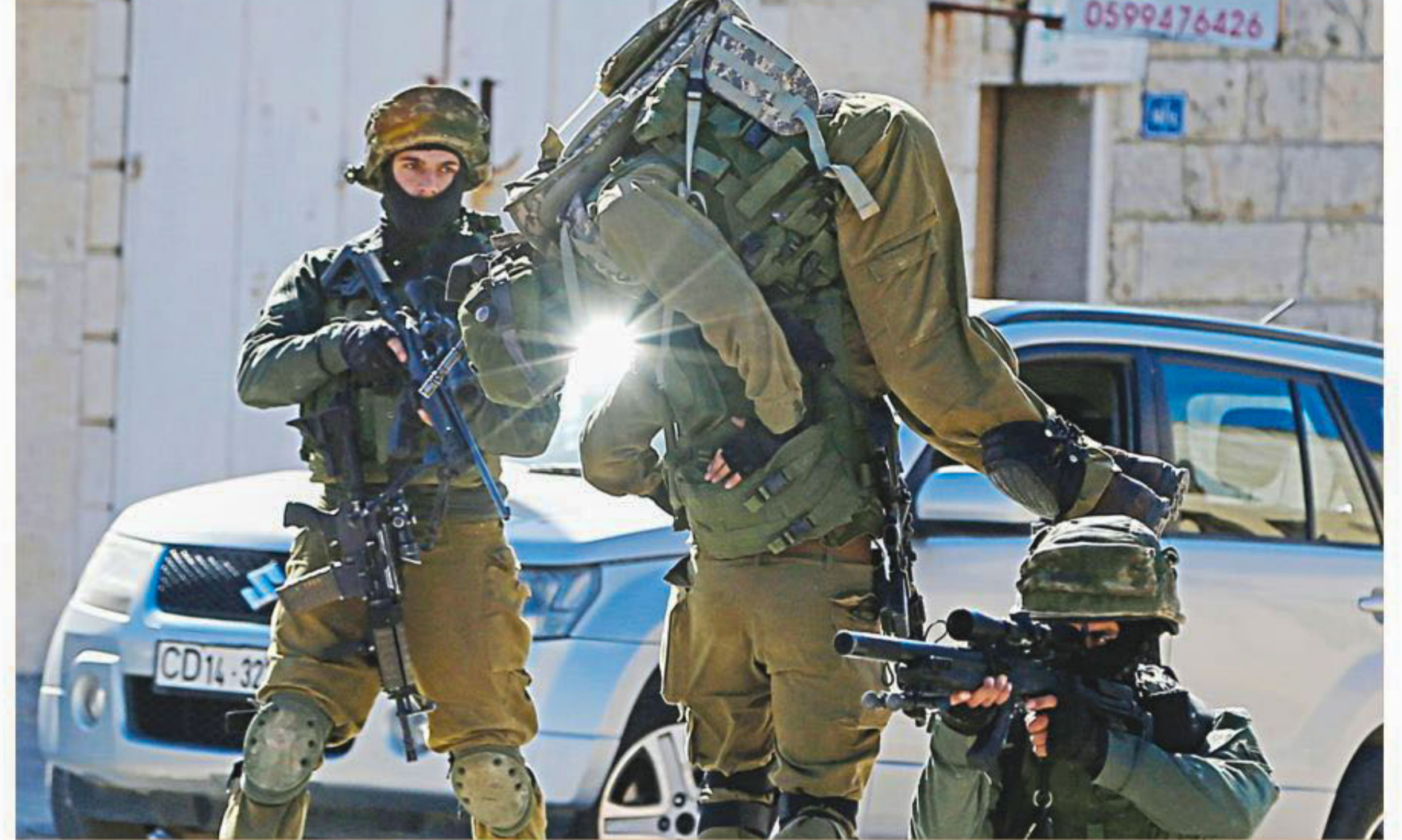
An Israeli soldier carries away a colleague, reportedly injured by a stone, during clashes with Palestinians at the Amari refugee camp, near the West Bank city of Ramallah, yesterday after Israeli soldiers entered the camp early in the morning.