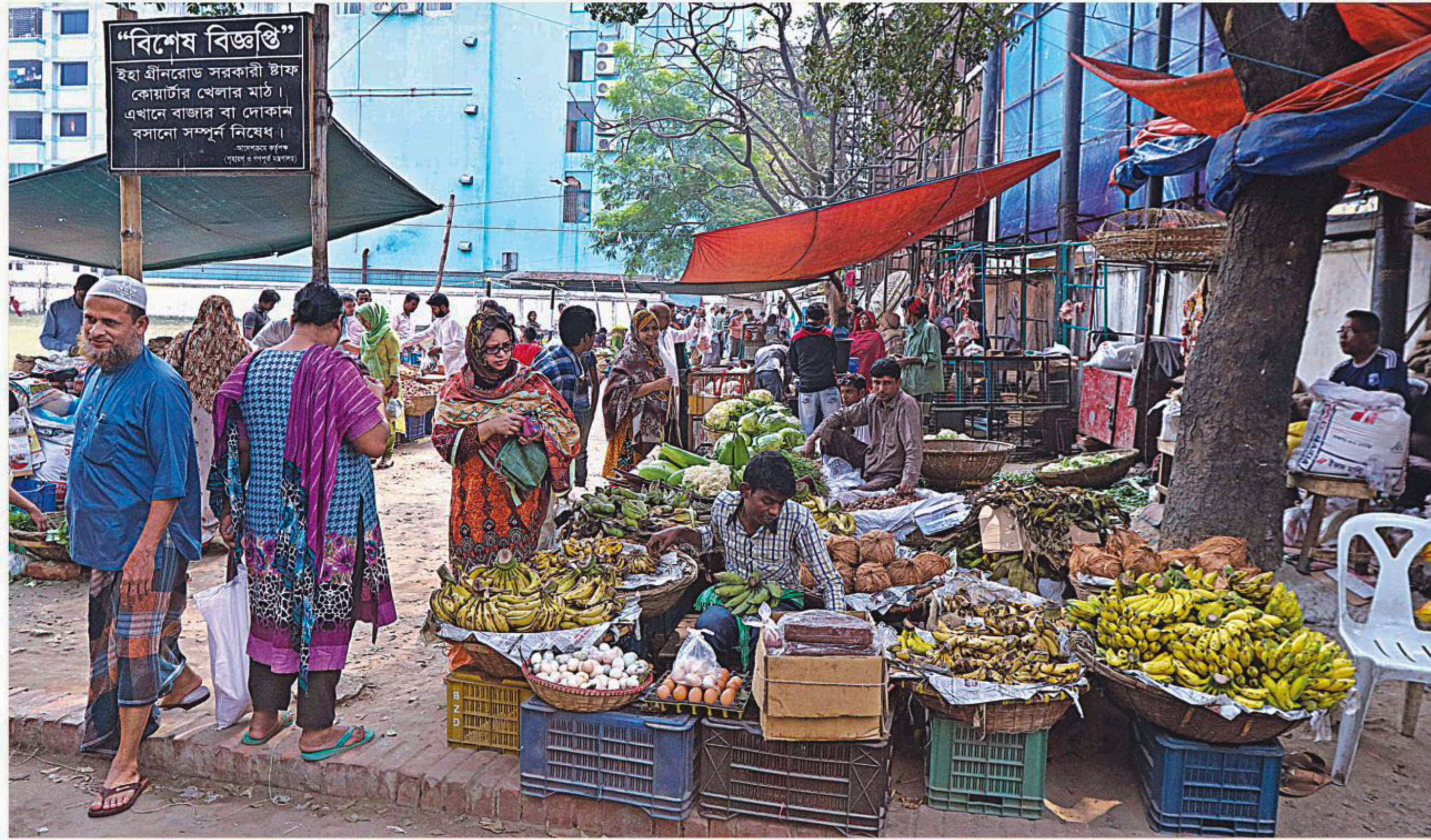
A part of the playground at the capital's Green Road government staff quarters is now being used as a kitchen market. A public works ministry signboard prohibits setting up of shops or markets there but traders, under the aegis of some influential people, are doing business at the place. The photo was taken a few days ago.