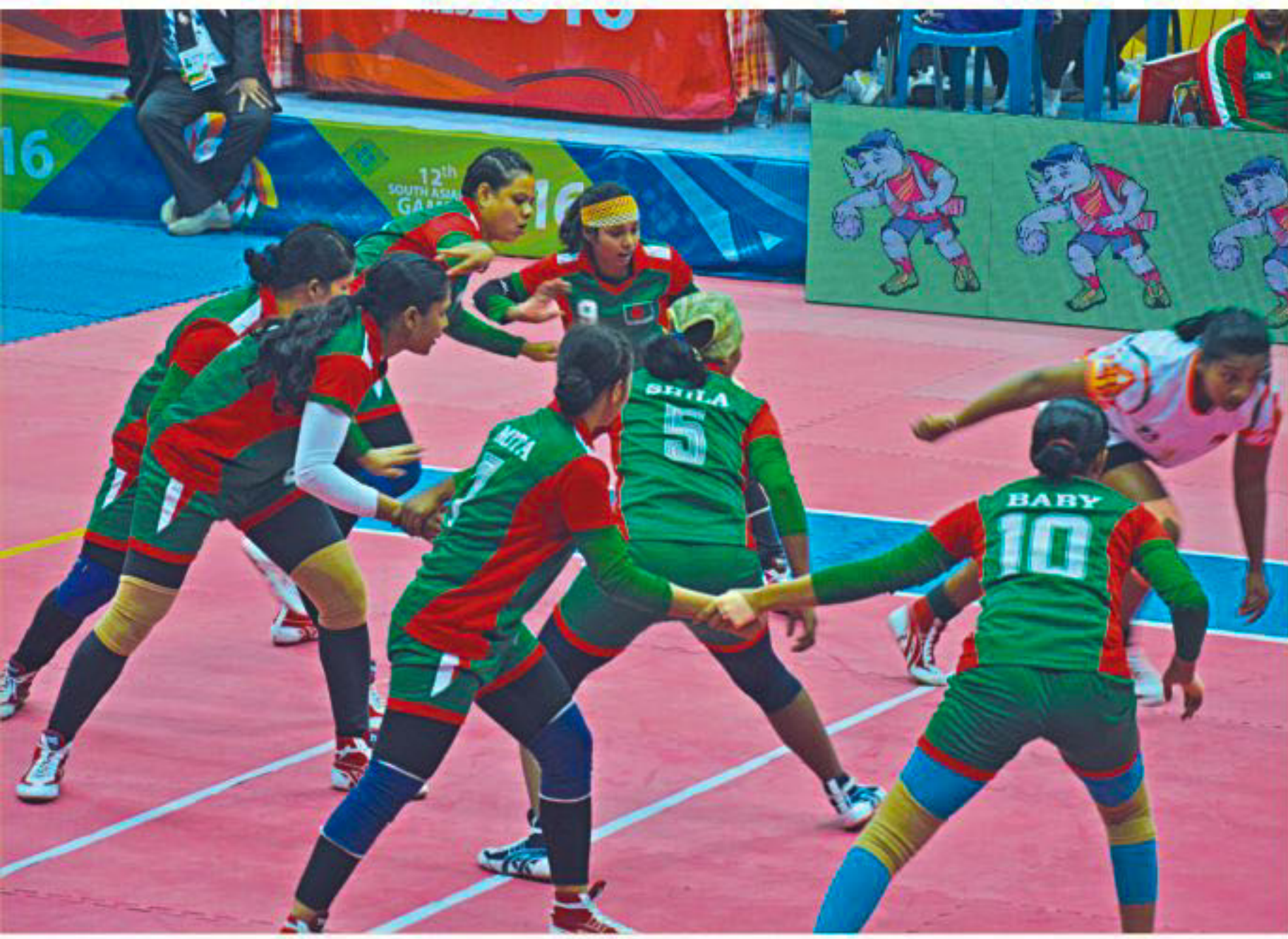
The Bangladesh women's kabaddi team players try to pounce on a Sri Lanka raider during their semifinal clash of the South Asian Games in Guwahati yesterday.