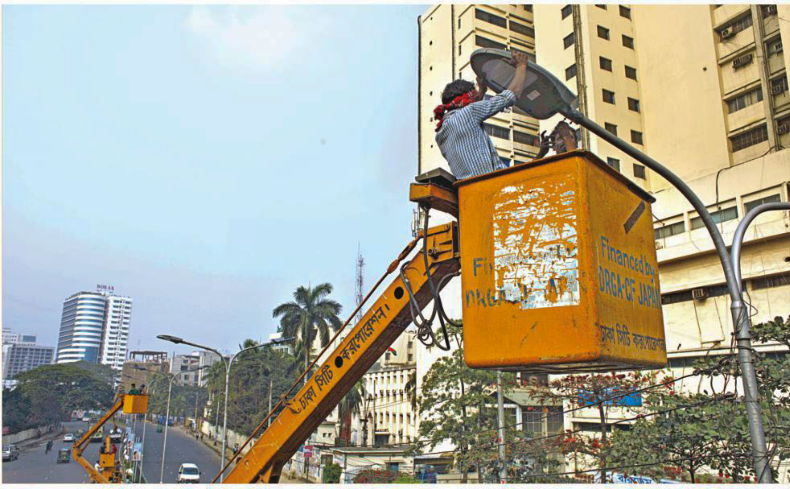
A Dhaka South City Corporation worker replaces a conventional sodium street light in the capital's Intercontinental Hotel area yesterday with a light emitting diode (LED) bulb, some to be run by solar power. The installation of the LED lights, which will save electricity and emit brighter lights is an initiative taken by DSCC as part of its Clean Dhaka campaign.