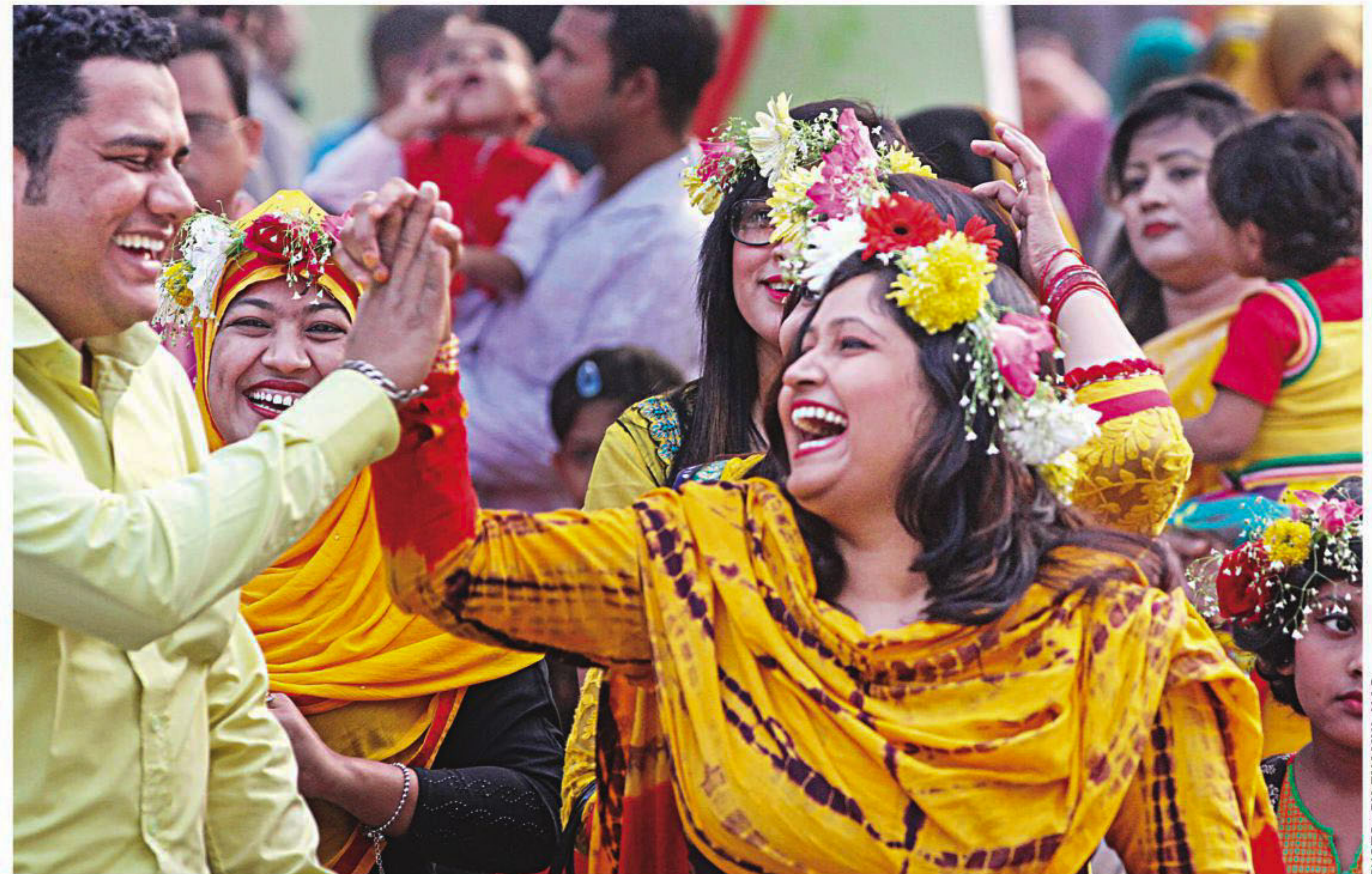
Merriment in good company during a weekend completes celebrations marking Pahela Falgun and Saraswati Puja yesterday in Dhaka University, where Amar Ekushey Granthamela 2016 is also being held. The photo was taken on the fair's Bangla Academy premises.