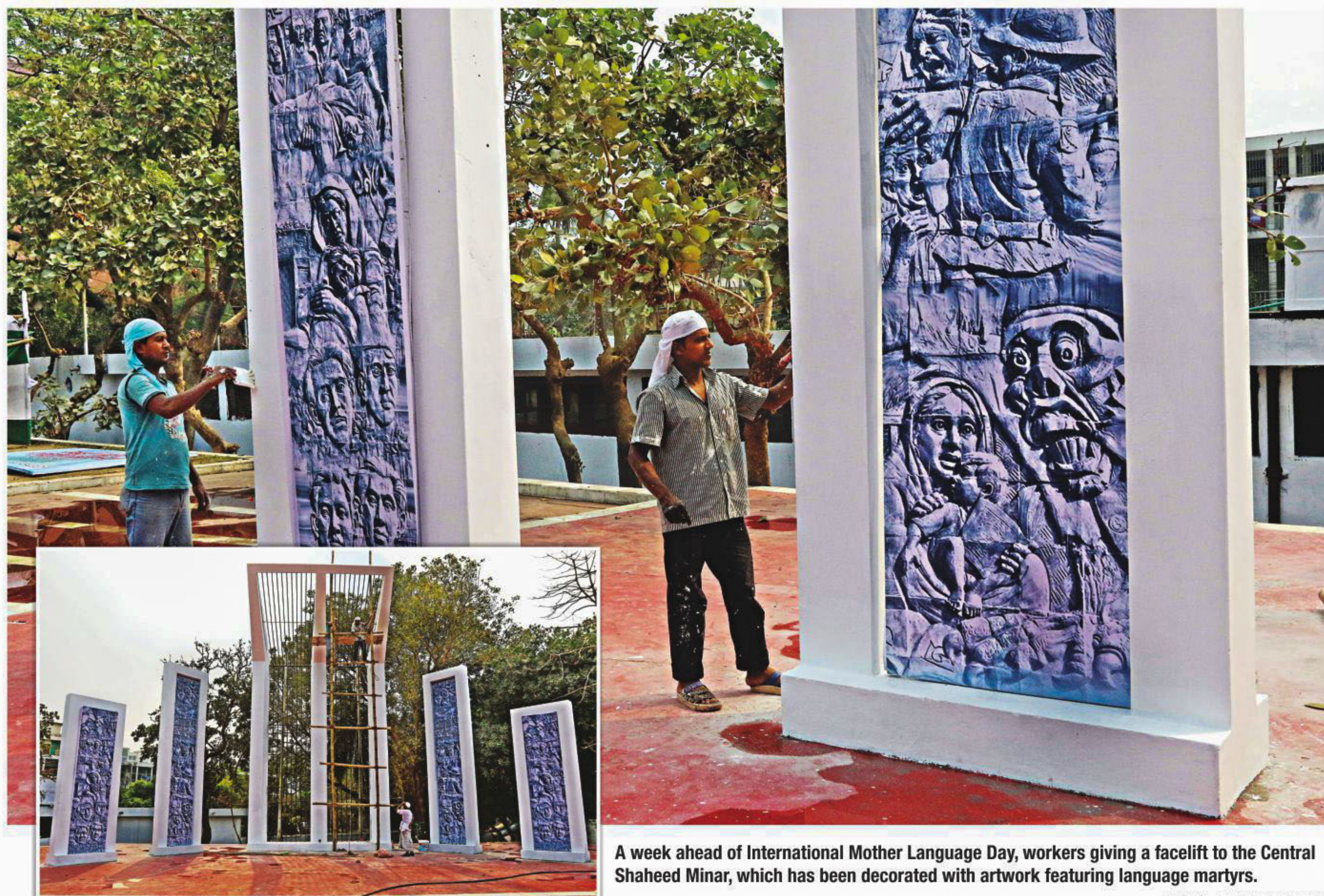
A week ahead of International Mother Language Day, workers giving a facelift to the Central Shaheed Minar, which has been decorated with artwork featuring language martyrs.