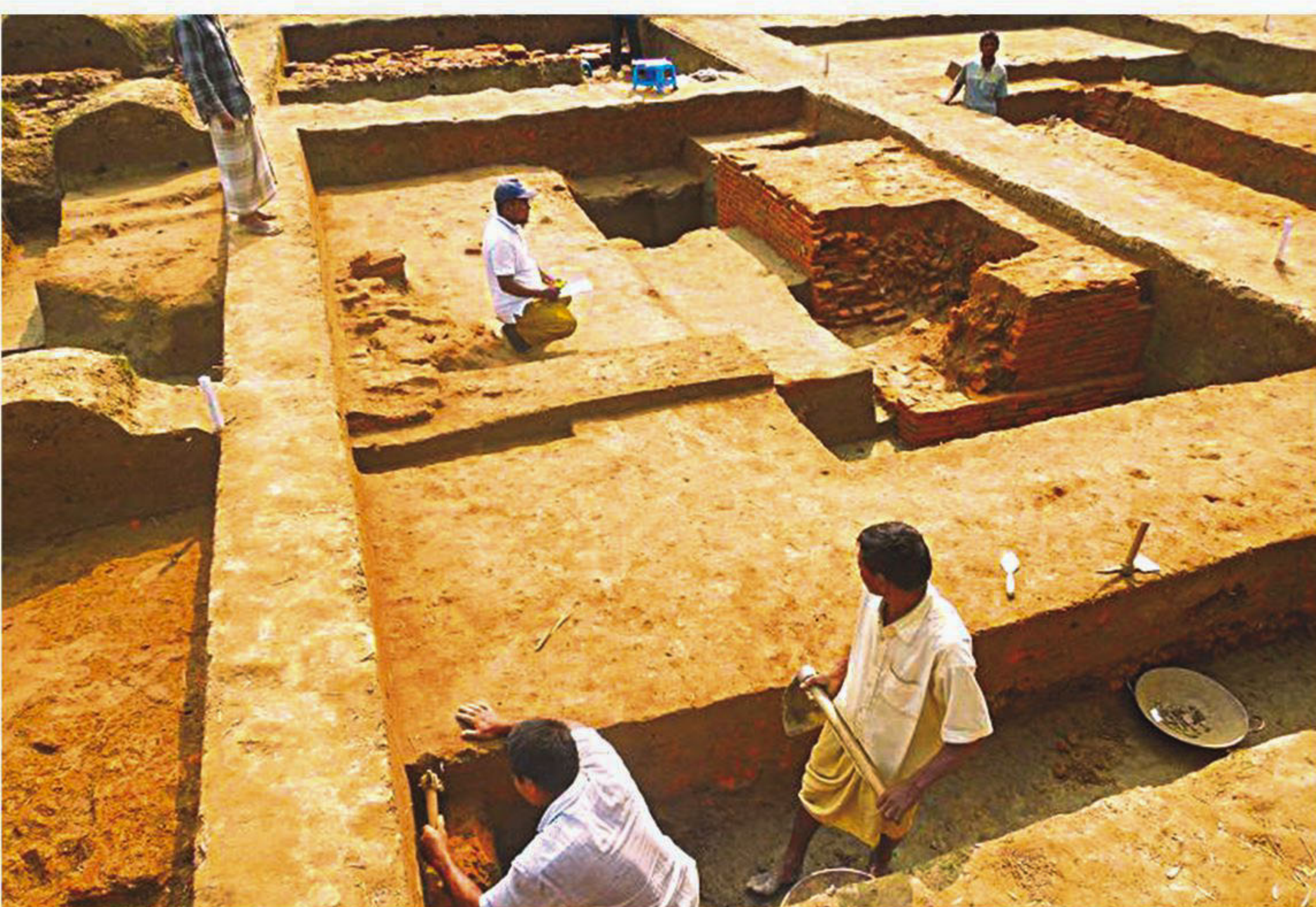
A team of the Department of Archaeology excavating a Buddhist temple with boundary walls, built 900 years ago, in Jaldhaka upazila of Nilphamari. The photo was taken recently.