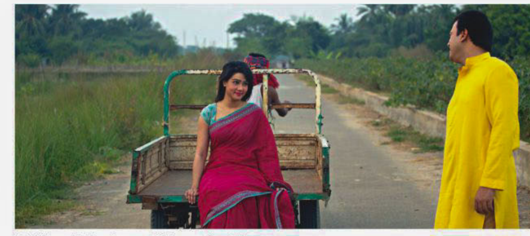
Mahi and Riaz in a still from the film.