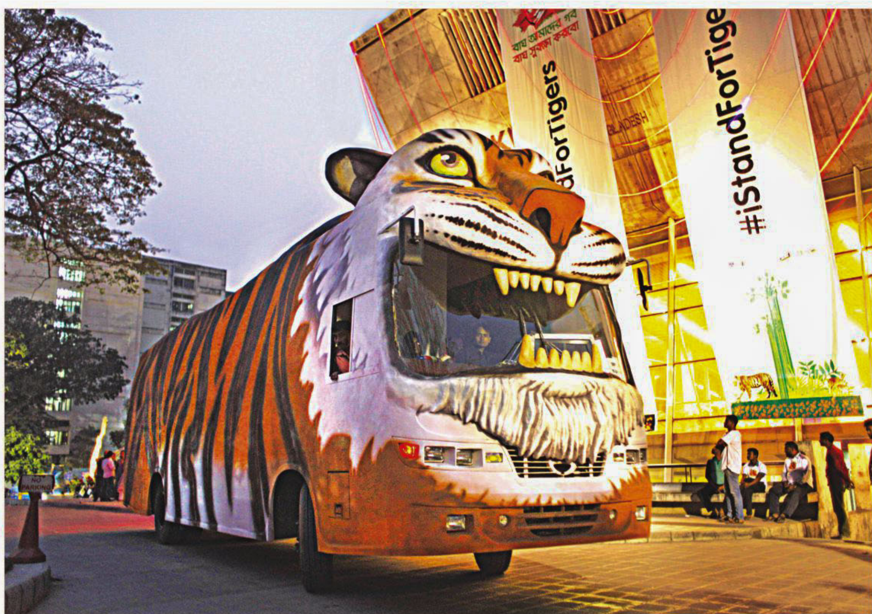
A bus of the TigerCaravan which would visit 100 strategic areas in the country to make people aware of the conservation of critically endangered species and their habitat, the Sundarbans. The photo was taken at Krishibid Institution Bangladesh in the city's Khamarbari yesterday.