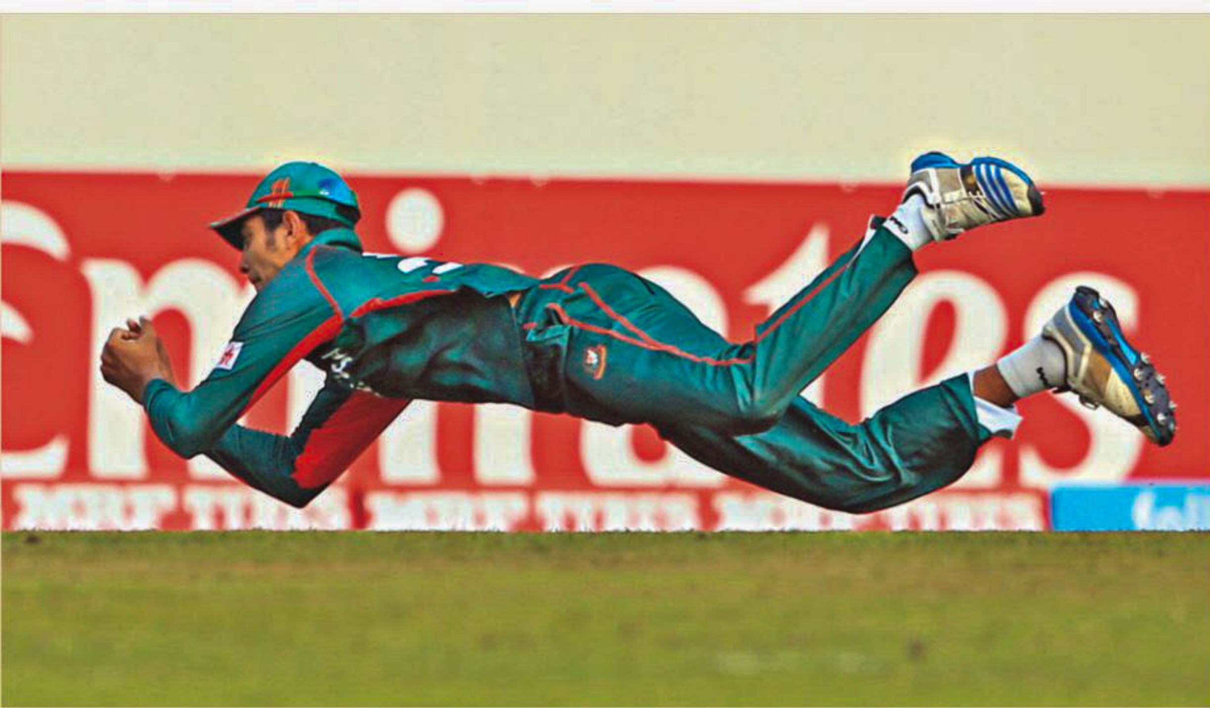
Bangladesh cricketer Saif Hassan completes a spectacular diving catch to dismiss West Indies skipper Shimron Hetmyer in the ICC Under-19 World Cup semifinal at the Sher-e-Bangla National Stadium in Mirpur yesterday. It was an isolated moment of brilliance from the Young Tigers as they were defeated by three wickets after being dismissed for a sub-par 226. STORIES ON PAGE 18

STATE MINISTER FOR ENERGY NASRUL HAMID SPEAKING IN PARLIAMENT