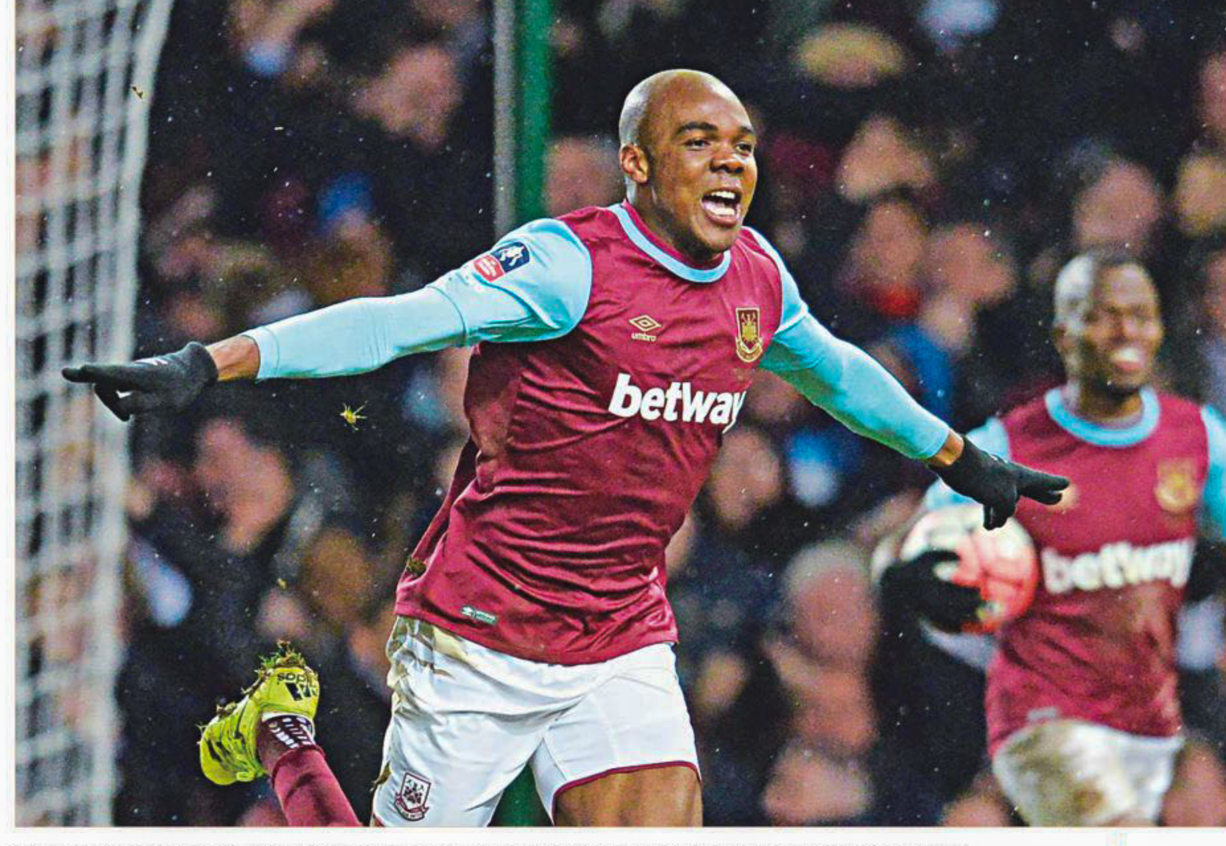
West Ham United defender Angelo Ogbonna celebrates his winning goal against Liverpool during their FA Cup fourth round replay in Upton Park on Tuesday.