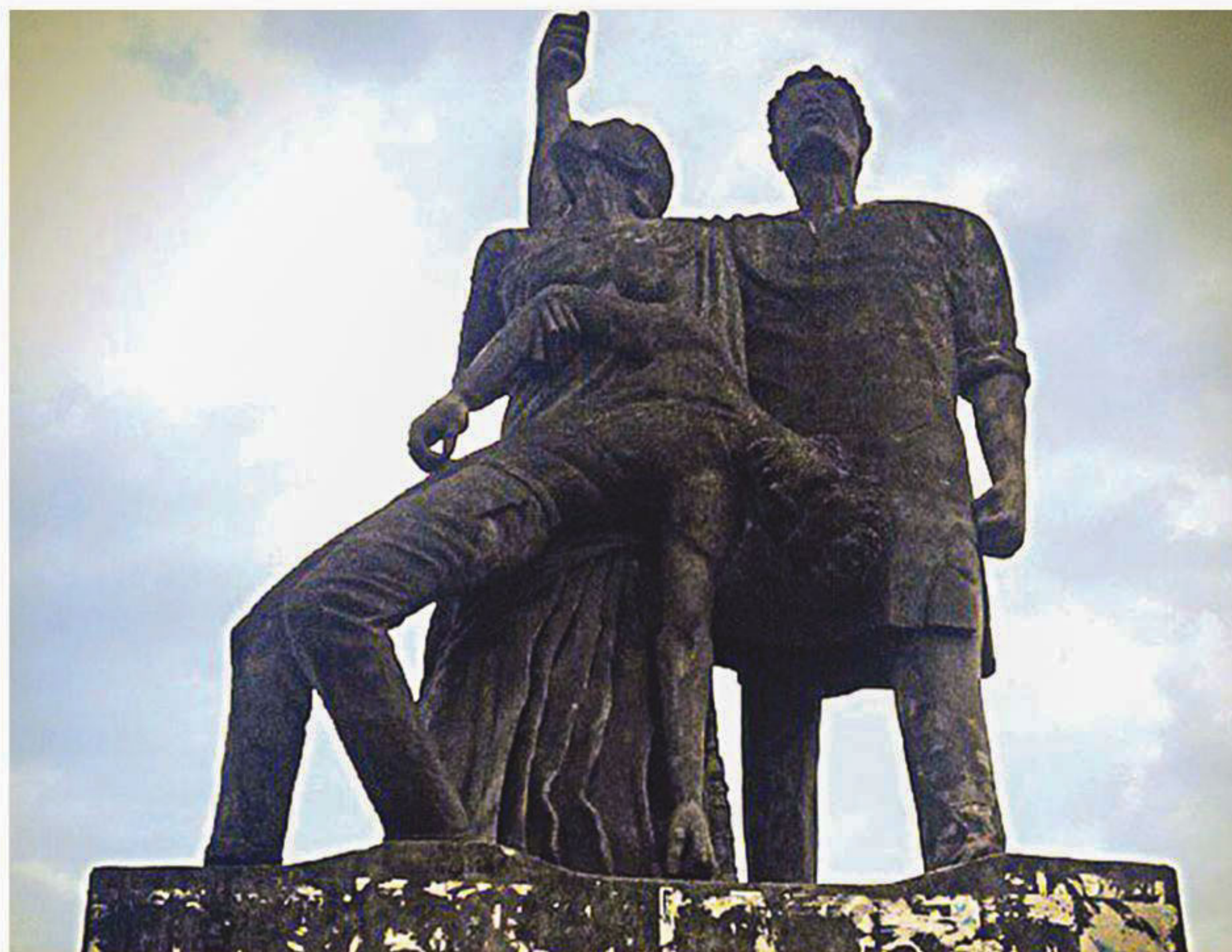
This sculpture "Amar Ekushey", depicting a woman holding her beloved son gunned down during the 1952 Language Movement and another man demonstrating by her, on the Jahangirnagar University in Dhaka remains shabby for around five years. The JU authorities say they are trying to arrange fund to reconstruct the sculpture built in 1991. The photo was taken recently ahead of International Mother Language Day on February 21.