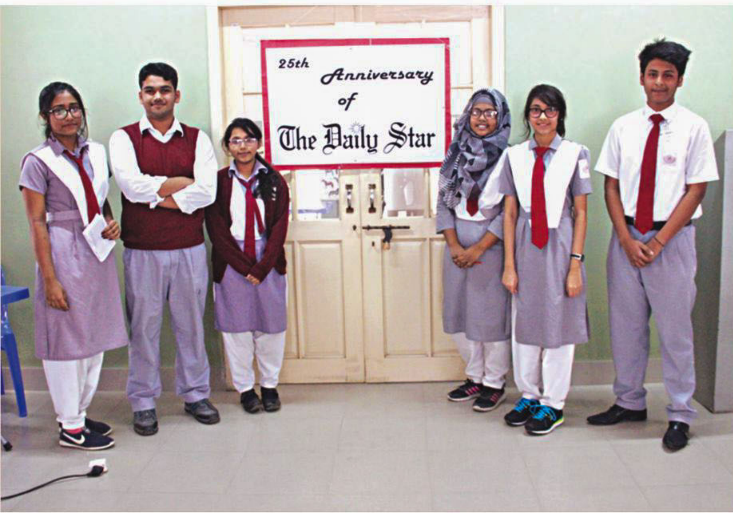
Students of South Breeze School on its premises in Dhaka during programmes marking the 25th founding anniversary of The Daily Star. Class IX students participated in an inter-school debate and the seventh- and eighth-graders took part in an essay competition.