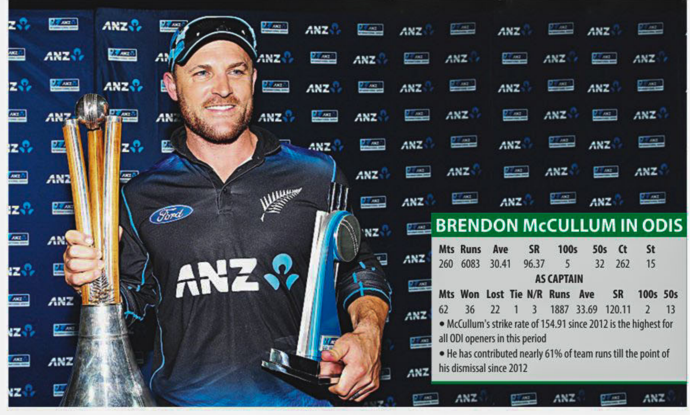
The ultra-aggressive New Zealand captain Brendon McCullum bowled out of ODI cricket with a series victory over Trans-Tansman rivals Australia at Seddon Park in Hamilton yesterday.

England opener Alex Hales fell one short of a second ODI century but his team completed a comfortable five-wicket victory over the hosts in the second match in Port Elizabeth on Saturday and took a 2-0 lead.