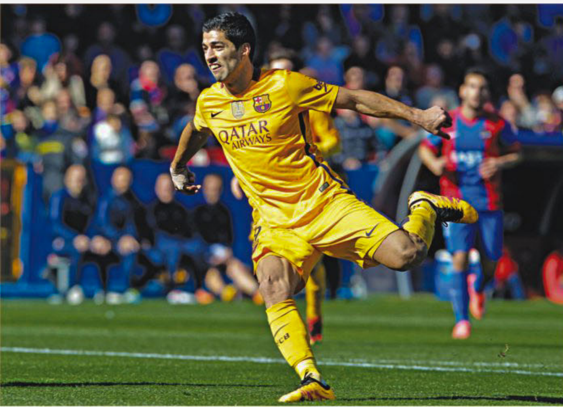
Barcelona striker Luis Suarez celebrates after his goal all but sealed a win for his side against Levante in their La Liga encounter at Ciutat de València yesterday.

beaten to safety by Diego Marino. However, Barca needed a slice of luck to open the scoring on 21 minutes as Jordi Alba burst down the left and his ball into the box was deflected into his own net by Navarro. Barca's star front three of Suarez, Messi and Neymar were kept for long periods, but they nearly combined for a brilliant second moments later when Messi picked out Neymar and his cross was turned wide by Suarez. Levante remain rooted to the foot of the table, but had won their previous two home games and deserved to be at least level at the break as they outplayed the Catalans in the latter stages of the first-half. Jose Luis Morales came closest to equalising when his low effort came back off the post eight minutes before the break. Levante continued to enjoy the better of the game in the second period, but found clear-cut chances hard to come by as Giuseppe Rossi's shot from outside the box was the only time Bravo was forced into action. Barca had barely threatened themselves after half-time, but did seal the points deep into stoppage time on the counter-attack as Messi picked out an unmarked Suarez to fire home his 35th goal of the season.