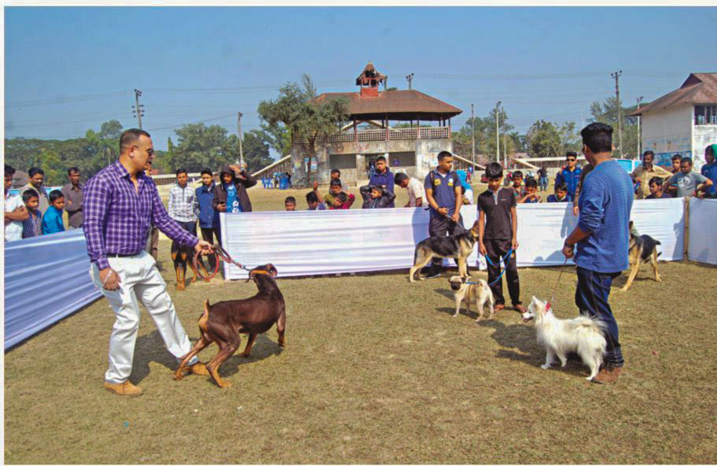
An exhibition of dogs on MC College premises in Sylhet city on Saturday. Around 50 dogs of six breeds participated in the six-hour event arranged by Kennel Club of Sylhet.

Following a government petition, the SC on November 2 last year stayed the process for holding the election till February 4 this year.