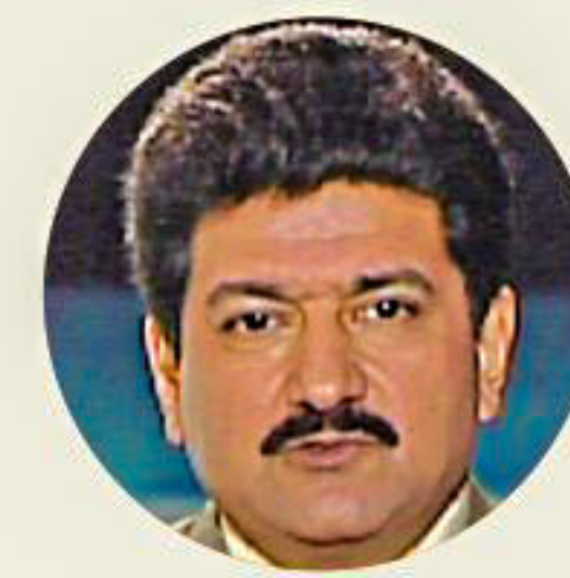
HAMID MIR EXECUTIVE EDITOR, GEO TV, ISLAMABAD, PAKISTAN

On behalf of Asia News Network, an alliance of 22 leading media in 19 Asian countries, a BIG congratulation to The Daily Star on your 25th anniversary. The Daily Star is an active member of Asia News Network, carrying the flag of professional journalism, adherence to facts and truth, and innovation in media multi-platforms at the very heart of South Asia. Asia News Network cannot be more proud to have you as a member.