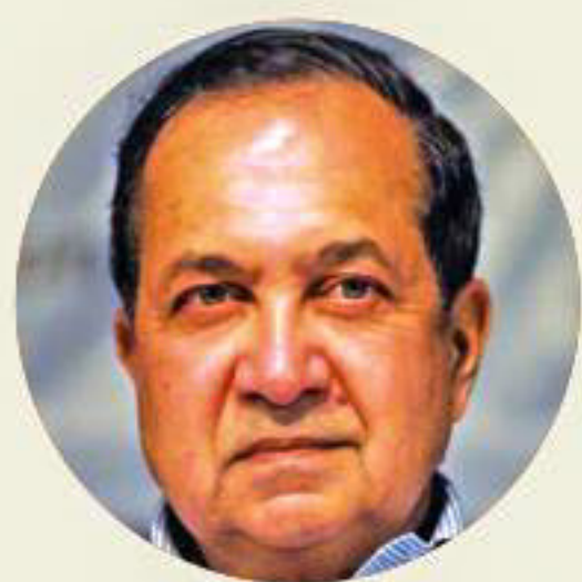
N RAM CHAIRMAN, KASTURI & SONS LTD, AND PUBLISHER, THE HINDU GROUP OF PUBLICATIONS, CHENNAI (INDIA)

A newspaper which keeps you abreast of happenings in Bangladesh, good or bad, peaceful or violent, democratic or authoritative ... That the reports are without any slant help you reach your own conclusion. This is the real task of a newspaper, a vehicle to carry information. Only free information can stir free response. It is an arduous task that the Star is performing without fear or favour. This is something commendable and speaks high of all those engaged in producing the paper, day in and day out.