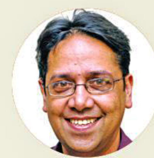
AKHILESH UPADHYAY EDITOR-IN-CHIEF, THE KATHMANDU POST (NEPAL)

I have followed the rise of The Daily Star over the past 25 years, and am convinced the paper has effectively upheld its core values of democracy, free press and development in Bangladesh.