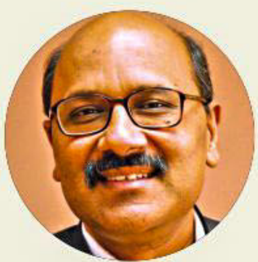
SHEKHAR GUPTA CHAIRMAN AND FOUNDING EDITOR, MEDIASCAPE PRIVATE LIMITED, AND FORMER EDITOR-IN-CHIEF OF INDIAN EXPRESS (INDIA)

The Daily Star could be called Bangladesh's first modern newspaper in terms of its expanded news universe and presentation. It represented the needs and yearning of an independent readership which its brilliant editor Mahfuz Anam recognised as the emerging powerhouse of a new demographic. My admiration and congratulations for a superb and historic achievement.