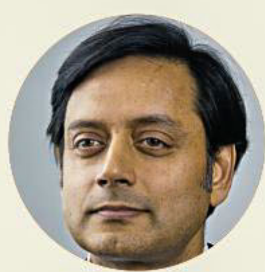
DR SHASHI THAROOR, MP CHAIRMAN OF THE PARLIAMENTARY STANDING COMMITTEE ON EXTERNAL AFFAIRS (INDIA)

As the leading English language daily in Bangladesh for a quarter of a century, The Daily Star has been one of the pioneers in journalism in the country. With its progressive approach and outlook, focus on top-class reportage and investigative journalism, The Daily Star has worked its way up to being an immensely influential national newspaper. As it completes a glorious 25 years, here is wishing the team the very best for the future.