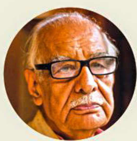
KULDIP NAYAR EMINENT INDIAN JOURNALIST, COLUMNIST & AUTHOR

Star IN THE EYES OF REGION'S TOP EDITORS, COLUMNISTS