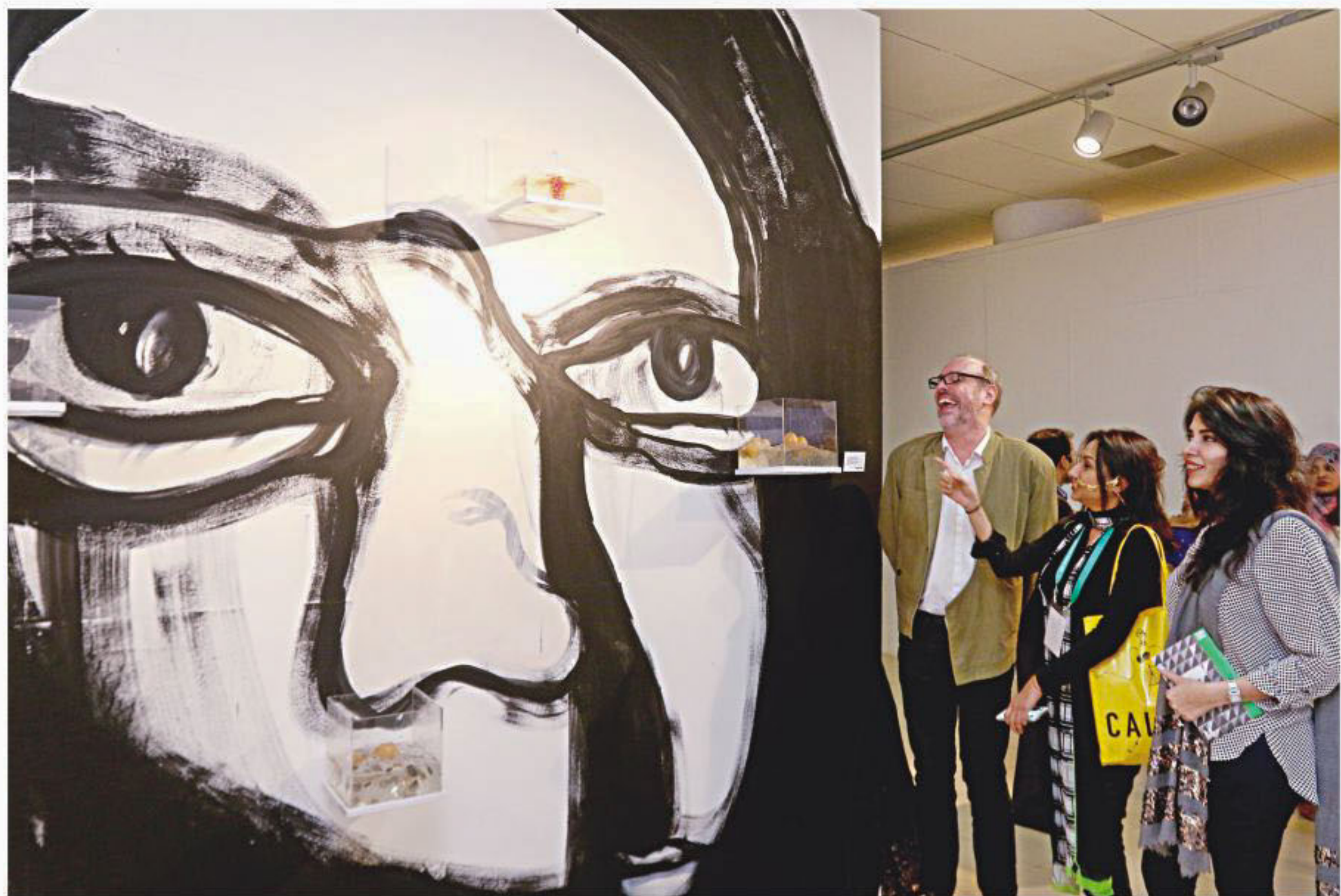
Visitors enjoying an artwork at Dhaka Art Summit 2016, which started at the capital's Bangladesh Shilpakala Academy yesterday.