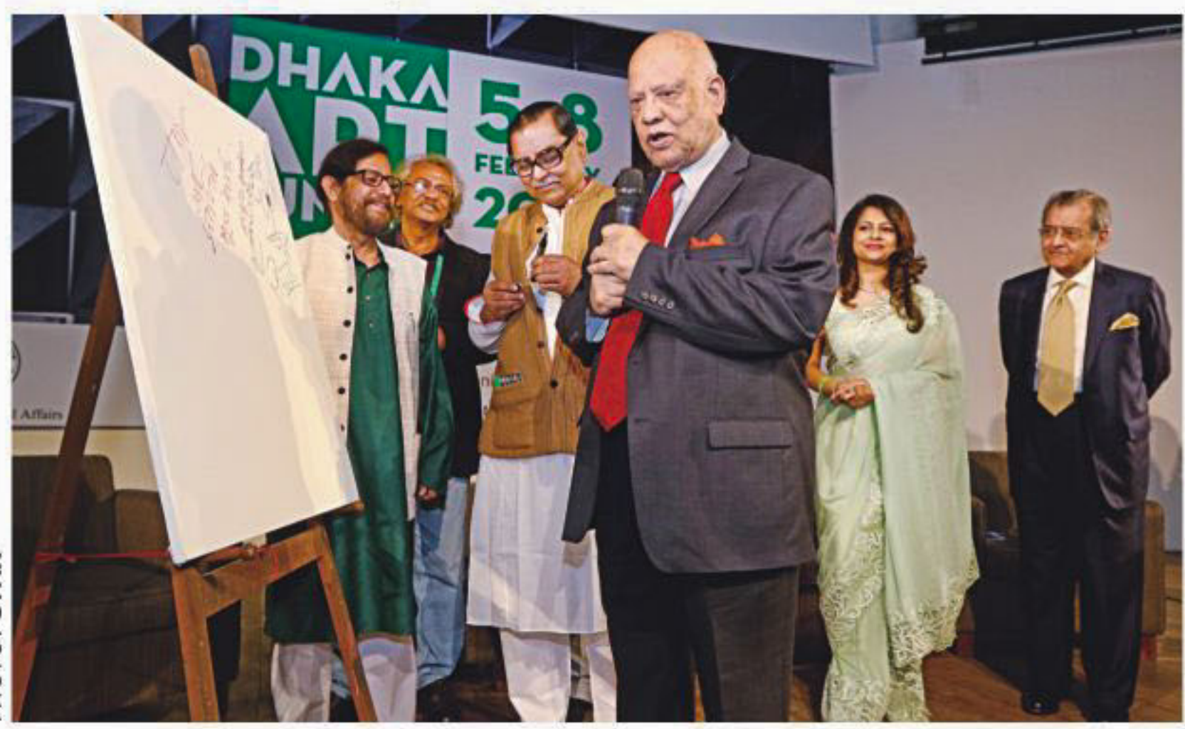
Finance Minister AMA Muhith speaks as chief guest at Dhaka Art Summit.

Produced by Samdani Art Foundation (SAF), the four day