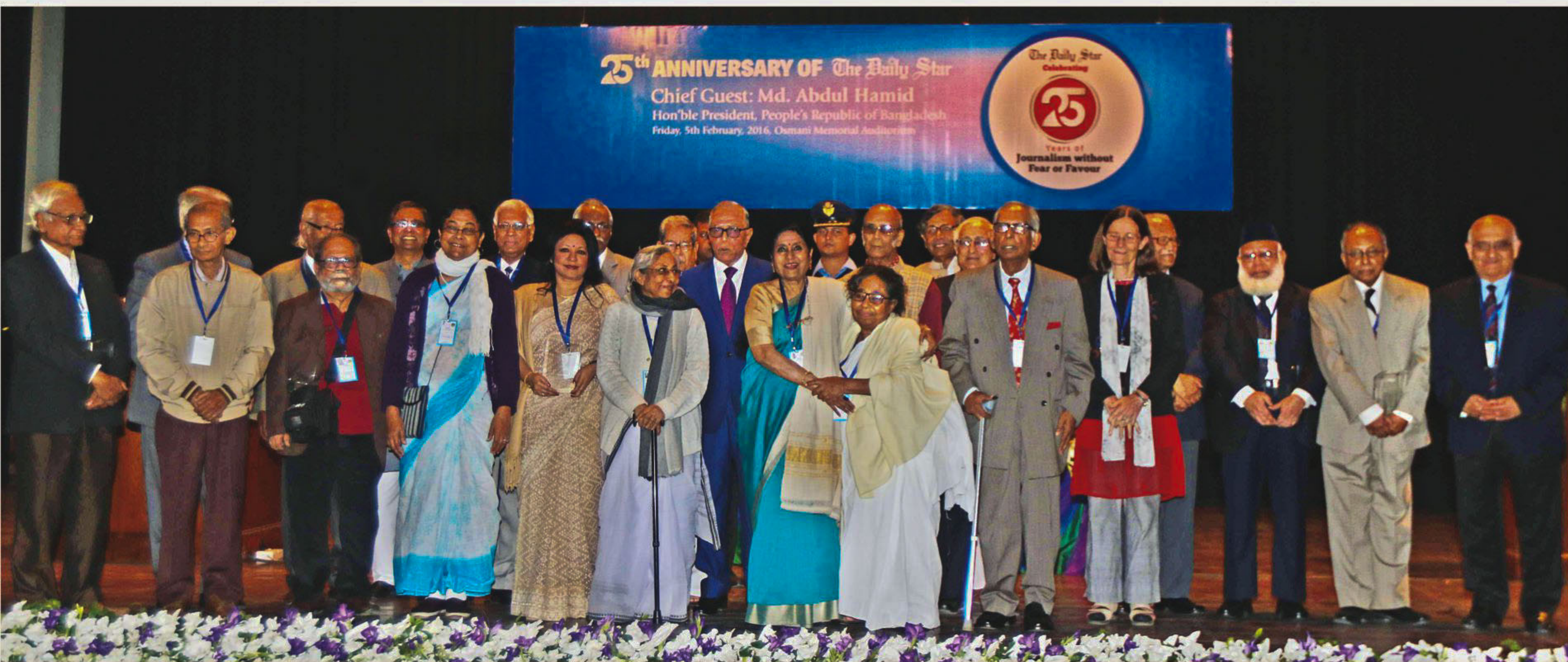
SALUTE ... The prominent individuals who have been awarded by The Daily Star for their lifetime contribution to nation-building pose with President Abdul Hamid for photos at the inaugural function of the newspaper's 25th anniversary at Osmani Memorial Auditorium in the capital yesterday morning.