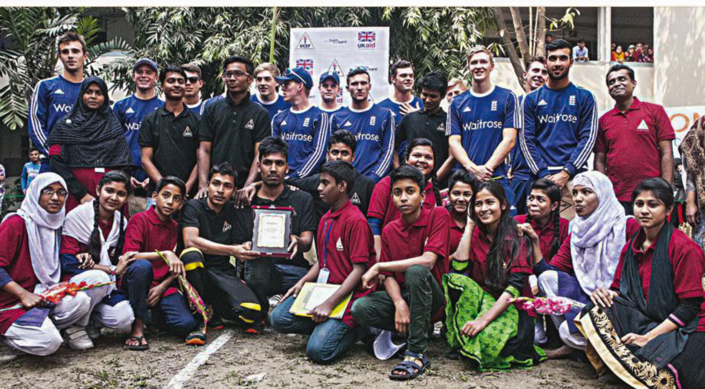
UCEP students faced the England Under-19 team at the UCEP premises in Mirpur yesterday in a friendly match. The students were overjoyed as they defeated England in the six-a-side two-over game.