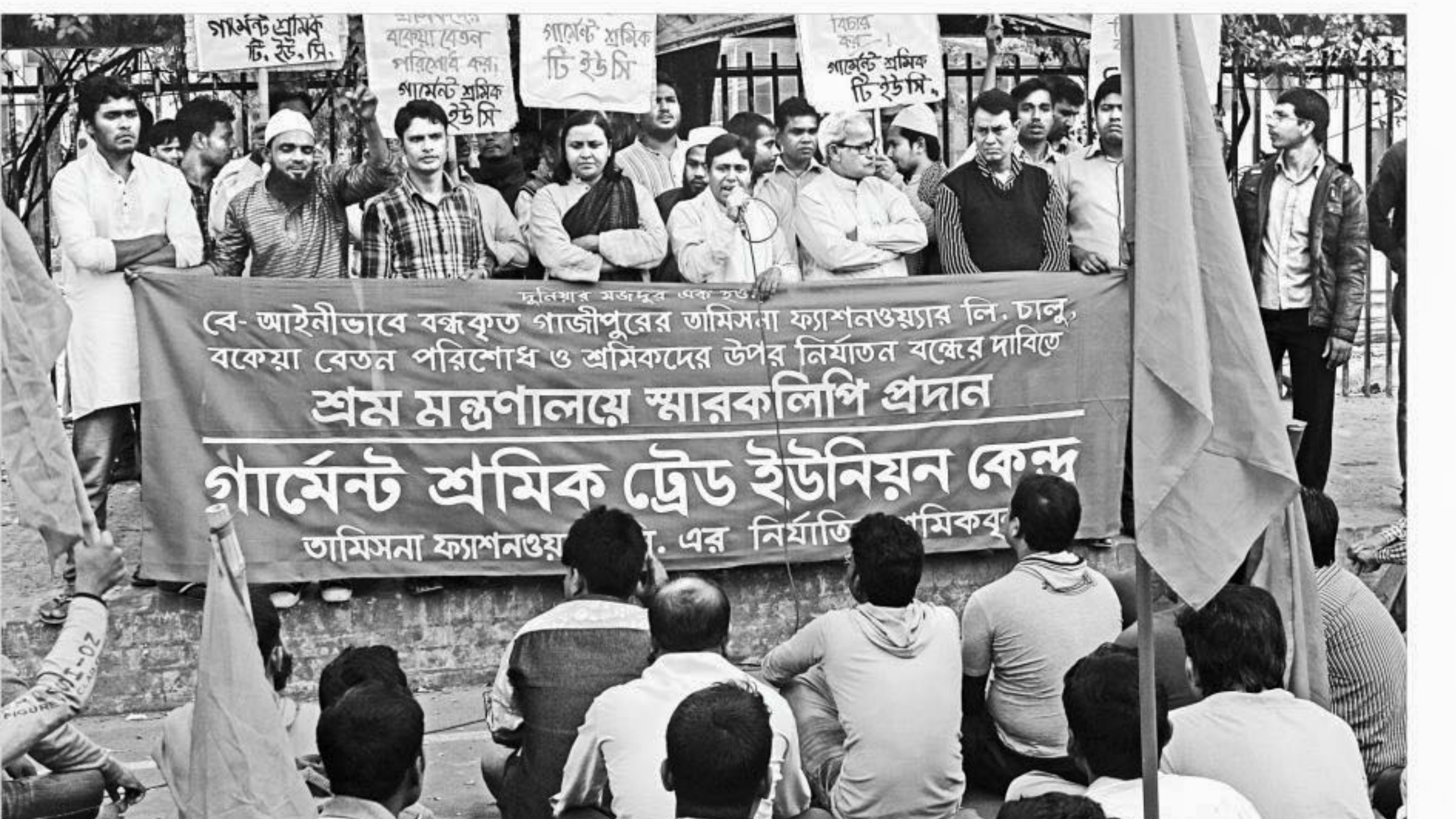
Workers of a Gazipur garment factory rally in front of the capital's Jatiya Press Club yesterday, demanding reopening of the factory and payment of arrears. Organised by Garment Sramik Trade Union Kendra, they also submitted a memorandum to the labour secretary, seeking intervention.

Computer education will be made mandatory in the future at primary level, she added.