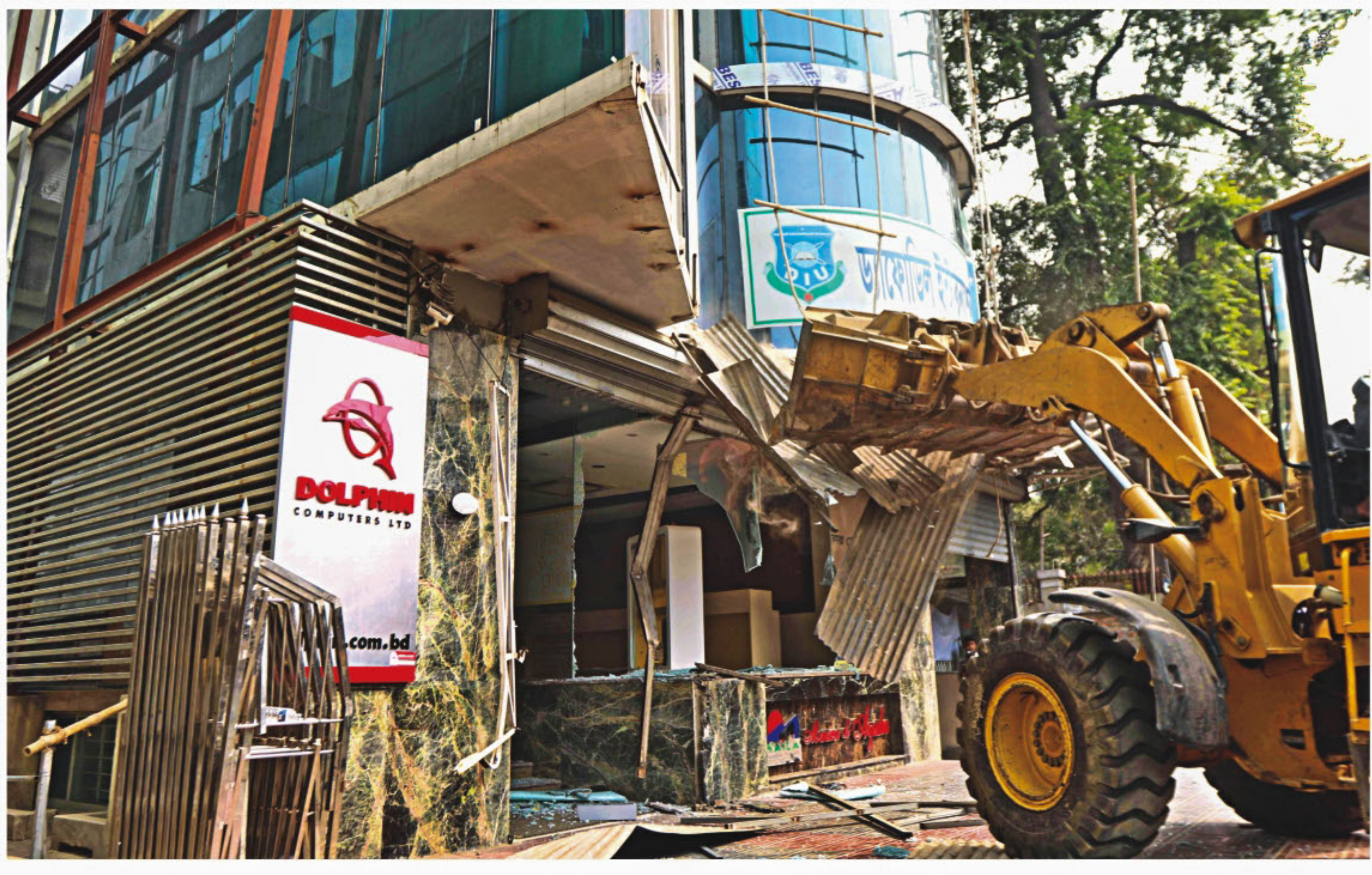
A bulldozer demolishes an illegal structure in the capital's Dhanmondi area yesterday during a drive by Rajdhani Unnayan Kartripakkha (Rajuk) in a bid to reclaim parking spaces in basements of buildings along Mirpur Road. Story on page 5.