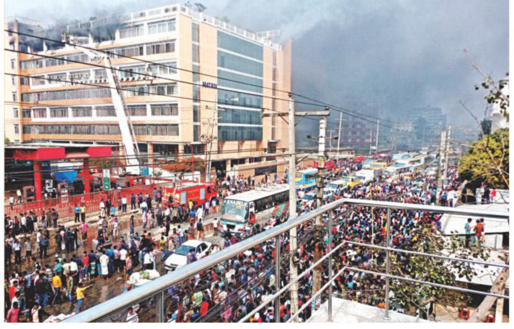
Black smoke rises from Matrix Sweater factory in Gazipur yesterday morning.