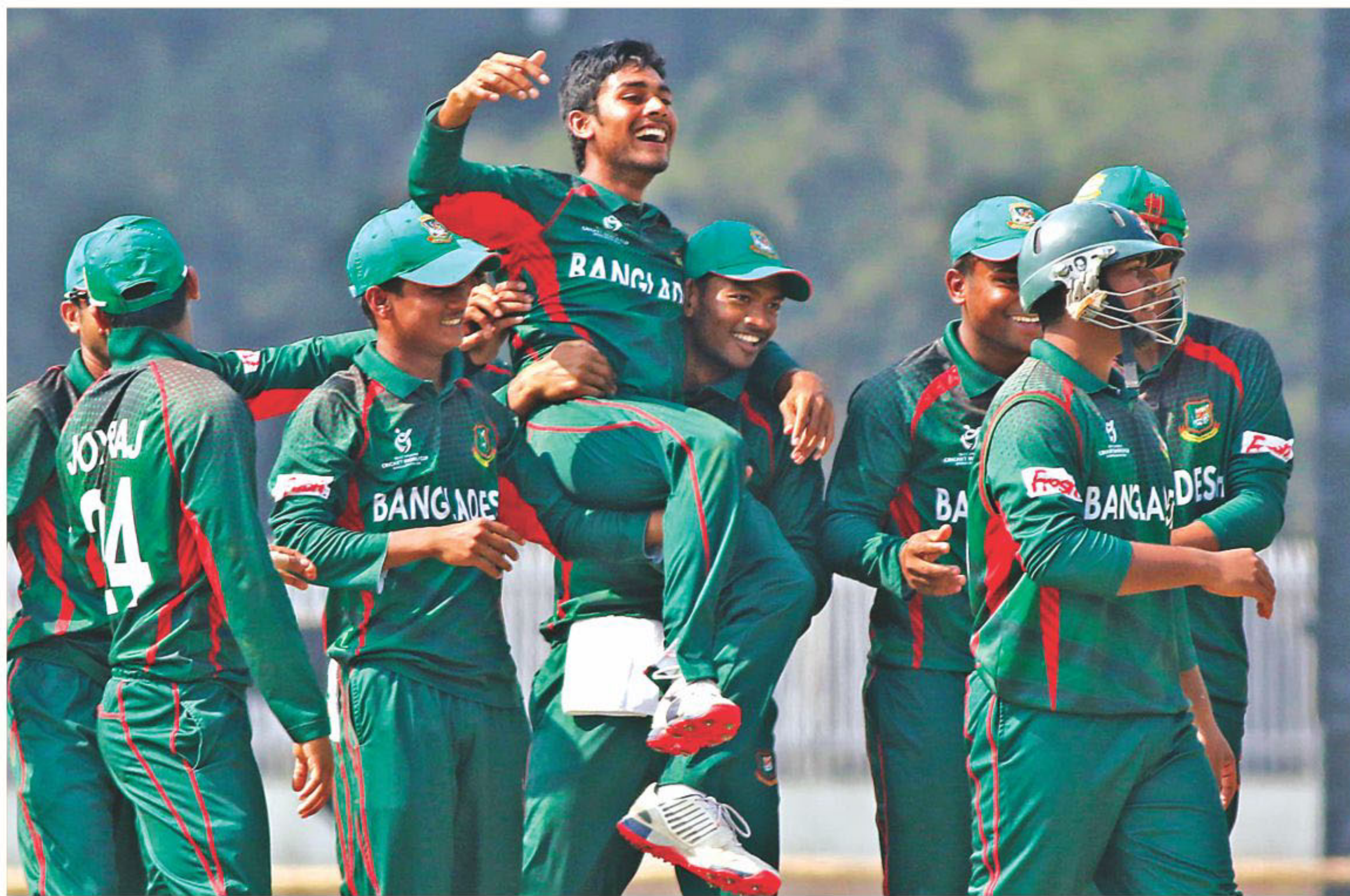
Record-breaking Bangladesh skipper Mehedi Hasan Miraz was the toast of his teammates after the Young Tigers beat Namibia by eight wickets to seal a place in the quarterfinals of the ICC U-19 World Cup at the Sheikh Kamal International Stadium in Cox's Bazar yesterday. Story on page 14