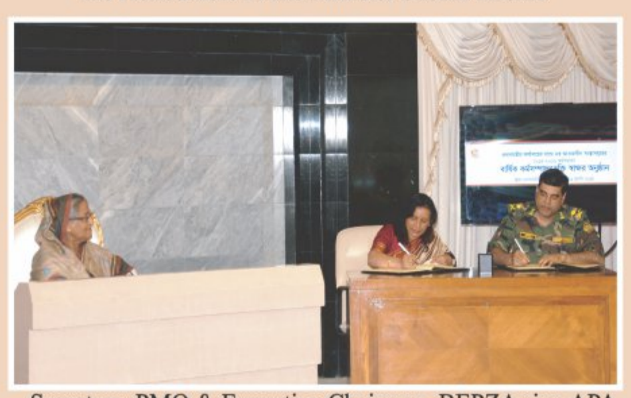
Secretary, PMO & Executive Chairman, BEPZA sign APA in presence of the Honourable Prime Minister