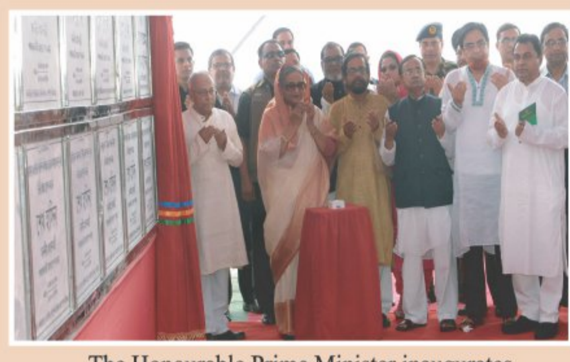
The Honourable Prime Minister inaugurates Central Effluent Treatment Plant in Comilla EPZ