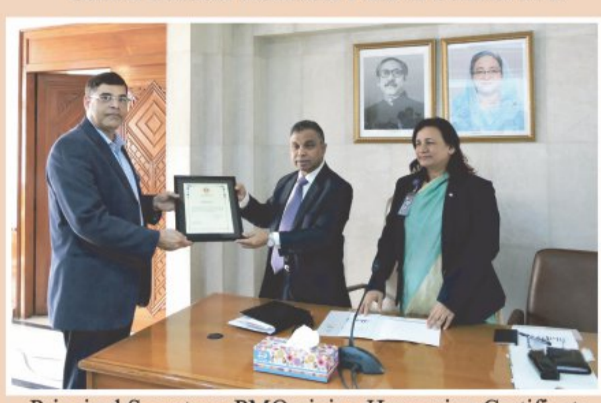
Principal Secretary, PMO giving Honouring Certificate to BEPZA Chief for accomplishing the KPI targets