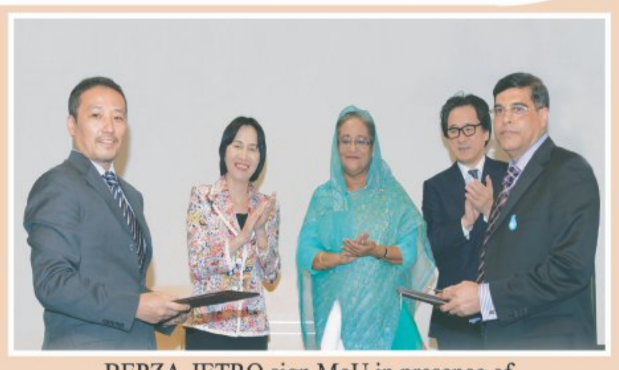
BEPZA-JETRO sign MoU in presence of the Honourable Prime Minister Sheikh Hasina