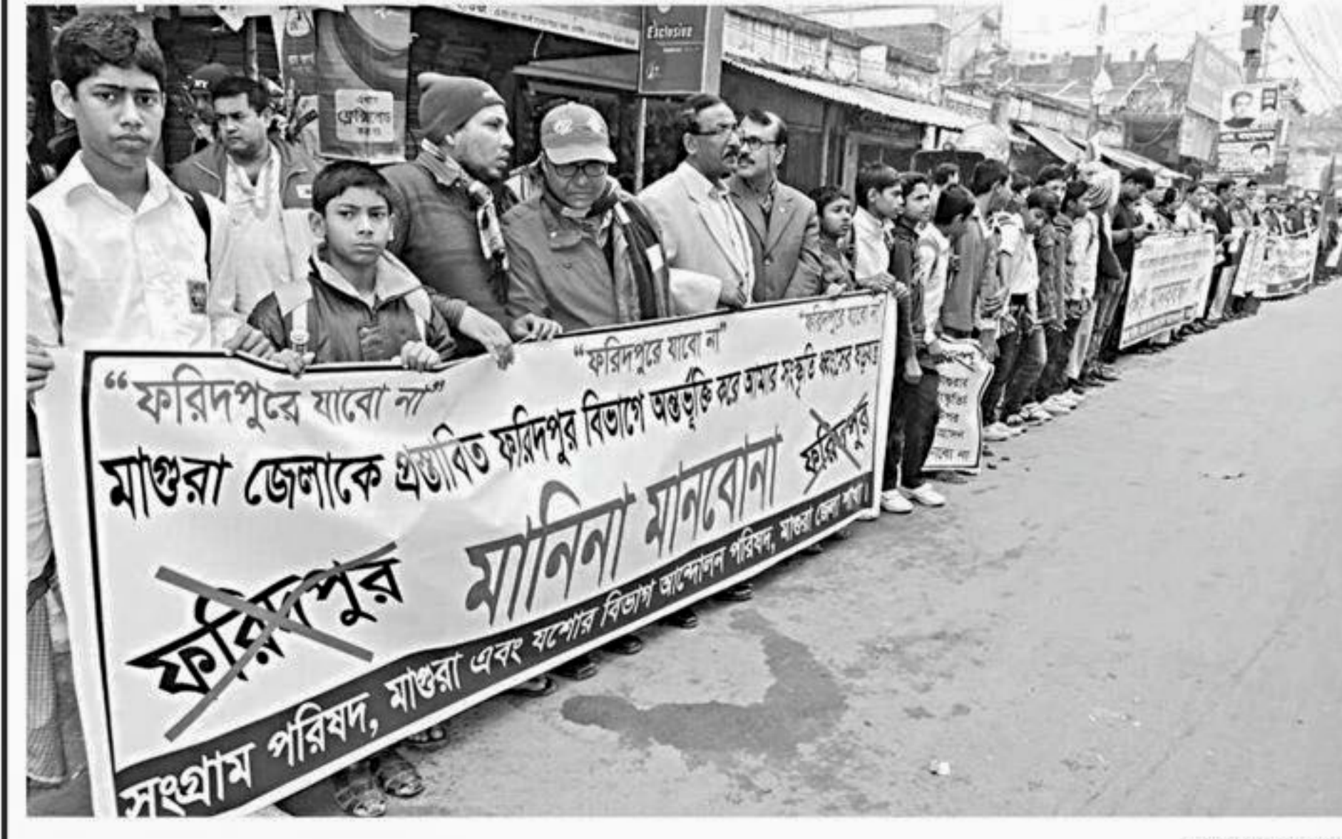
Magura townspeople formed a human chain yesterday, demanding that the government declare Jessore as division instead of Faridpur.