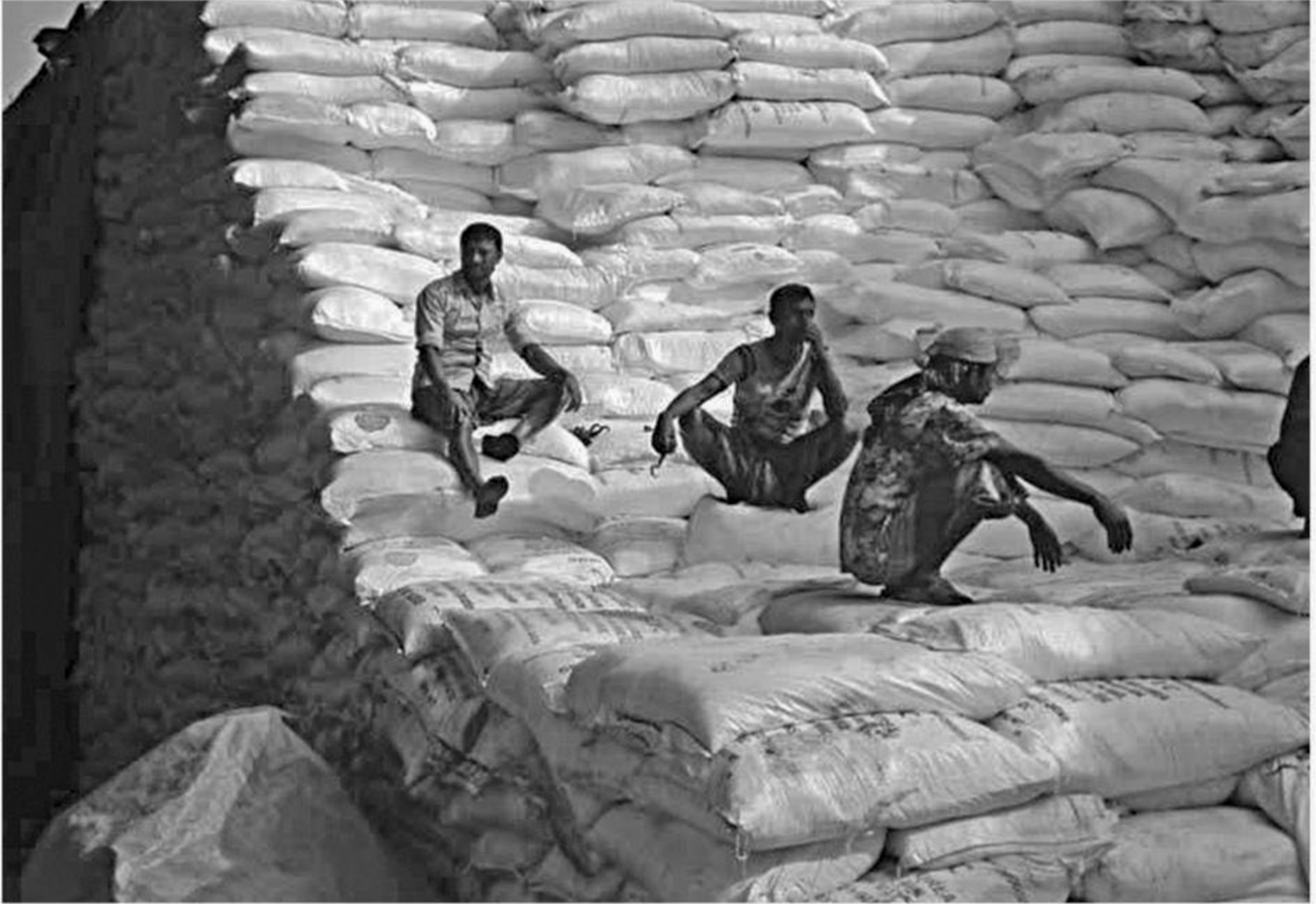
A huge amount of fertiliser stacked under the open sky on the premises of Gaibandha's warehouse remains vulnerable to clotting and quality deterioration due to exposure to dense fog.