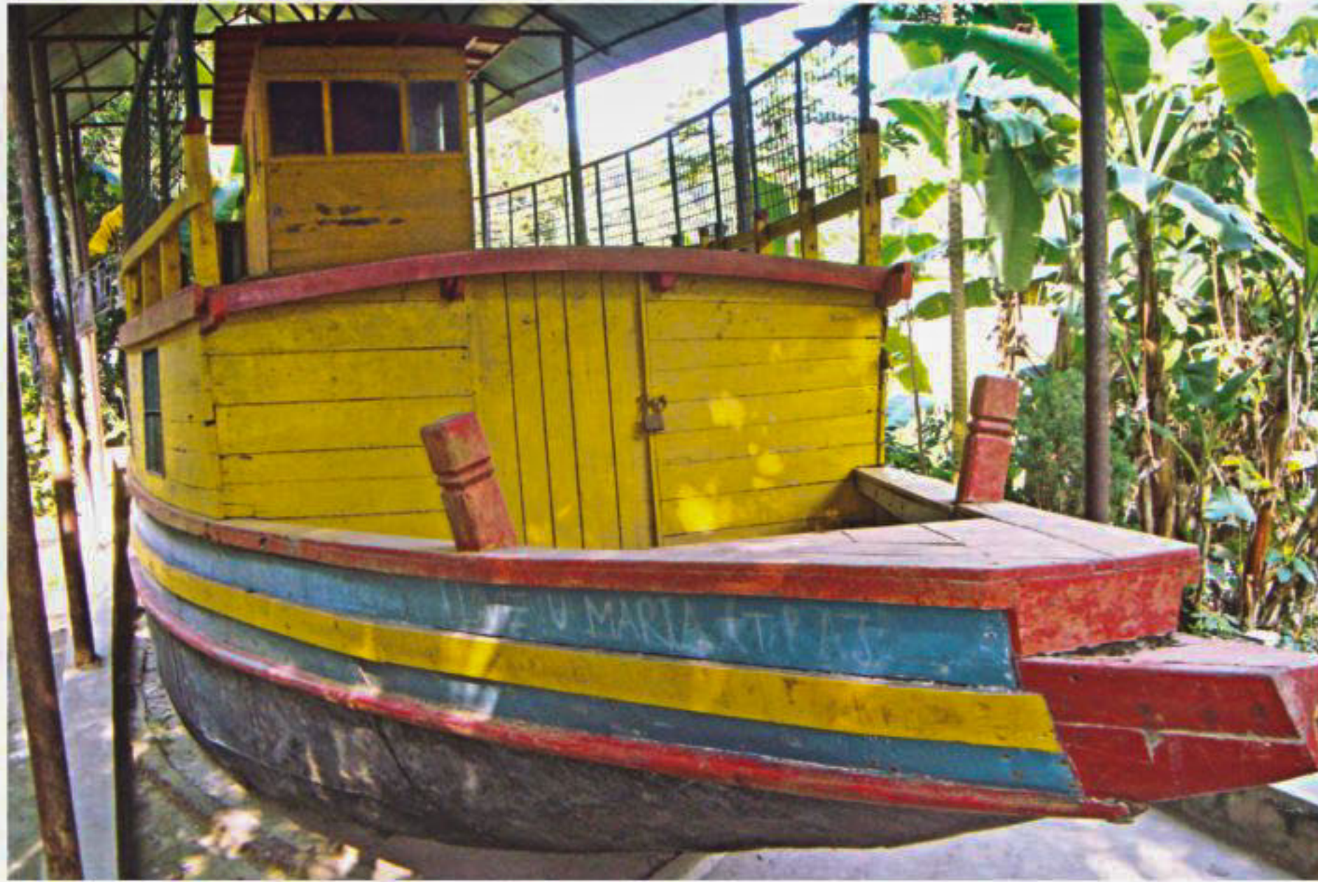
Sultan's engine boat lying idle on the bank of Chitra.

AZIBOR RAHMAN, Back From Narail Master painter SM Sultan's Shishu Swarga, an art learning centre for Children in Narail, is now on the verge of closure due to a lack of teachers. There are four buildings which are used for different purposes. One is an art gallery. Shishu Swarga is used for teaching students. There is also a library and office. Besides, a large engine-driven boat is lying idle by the side of River Chitra. After the passing away of three teachers and organisers of the centre, the institution is now in an almost-abandoned condition. SM Sultan established the institution in 1978 at Kurigram on the outskirts of Narail town to teach painting to children. He also made an engine-driven boat for the students so that they could learn boat riding and enjoy the serenity of nature. After his death on October 10, 1994, Sultan's adopted son painter Dulal Saha, his disciple Kajal Mukharjee and Liton Biswas took on the responsibility of the institution.