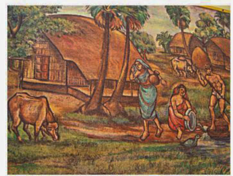
A painting by Sultan.