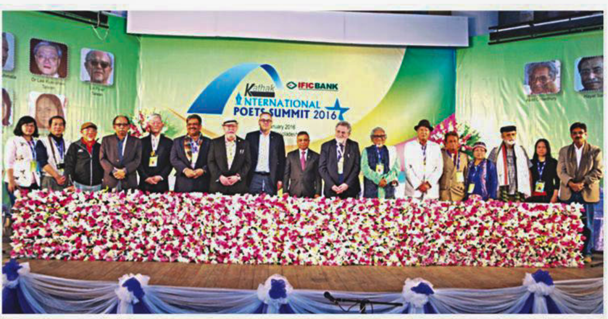
Guests and organisers at the opening ceremony.

up and distorted. Animations of bikes progressing clock and counter-clockwise on the edge of the videos seem too long for a soon-to-be-forgotten past, or to aspire for a bright future. Shimul Saha's poignant light installation, "Toward the Being" and the various light-boxes, representing rotting leaves, directly refer to the sapping powers of cancer. In the context of the exhibition, the glowing artworks read as a larger metaphor for an entity confronted to the degeneration of its parts; a body attacked and slowly exhausting - and an indirect hint to the effects of human activity on nature. The show, opening from 12pm to 8pm every day, will continue till February 27.