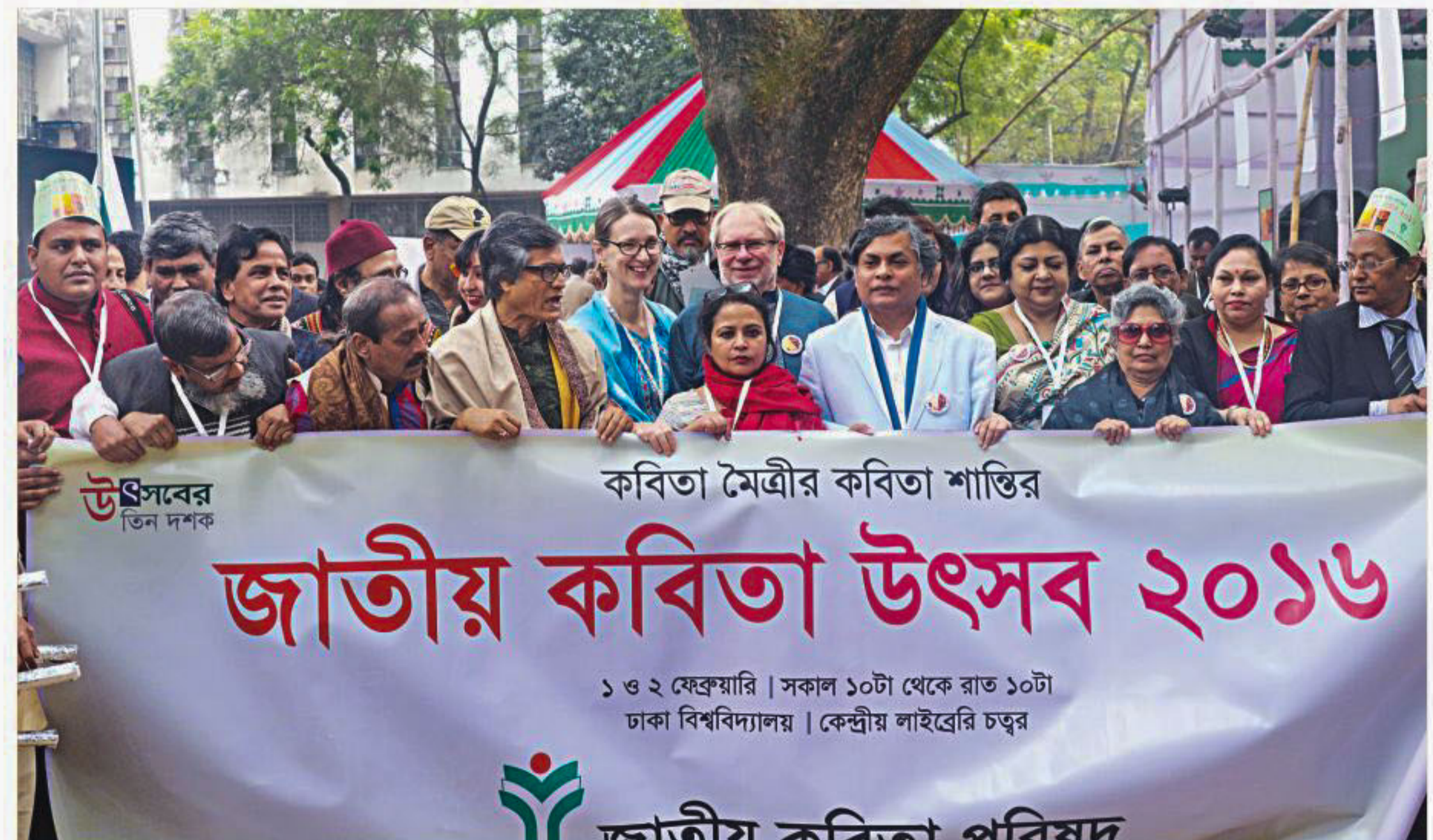
The 30th Jatiya Kabita Utshab (National Poetry Festival), under the theme "Kabita Moitir, Kabita Shantir" (Poetry for Friendship, Poetry for Peace), begins amid festivity and enthusiasm on the Central Library premises of Dhaka University yesterday.

The two boys went missing after they had gone to nearby Haria High School in Tangail to watch annual sports competition there. The next day, the abductors demanded Tk 1 lakh to each of their families over the phone as ransom.