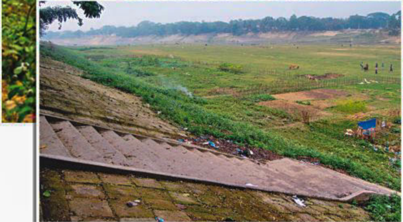
Once vibrant and tidal Surma, the heart of Sylhet, has lost its vigour and looks like a dried up canal, due to land grabbing, illegal and lack of proper dredging and erosions, causing a serious water crisis in the localities. The bank of the river has dried up severely for miles, inset, due to people's lack of awareness and authorities' indifference, which, even in the monsoon season does not fill up completely. The photos were taken near the south Kushighat Borhanuddin Mazar area yesterday.