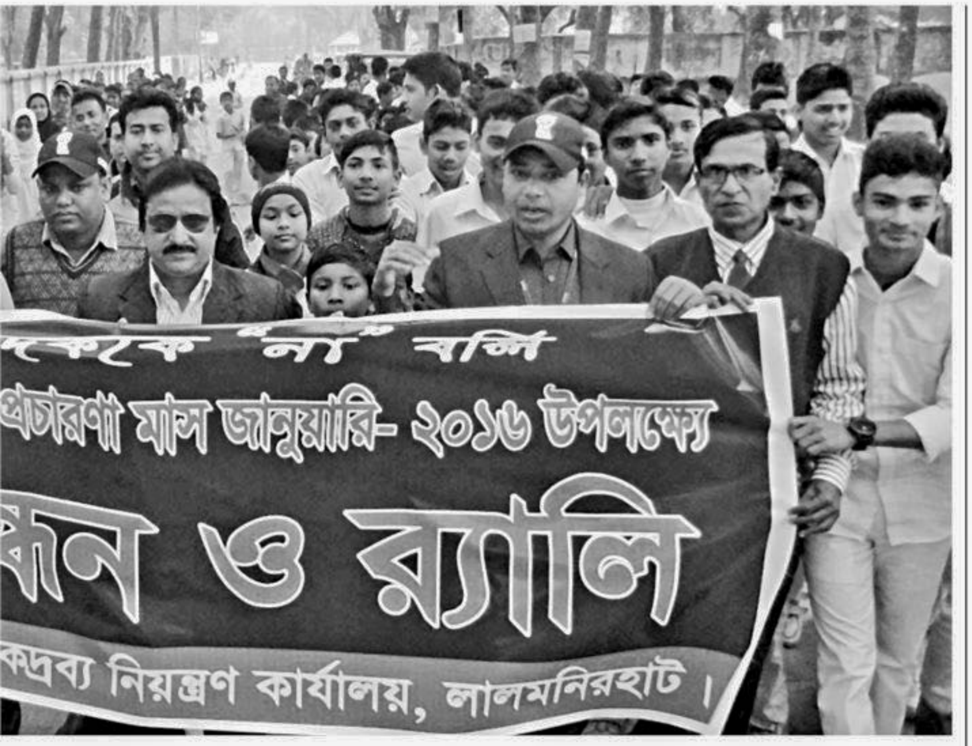
The Department of Narcotics Control in the district organises a procession on Station Road in Lalmonirhat town yesterday marking their month-long campaign against drug abuse.

She was rushed to Chapainawabganj Adhunik Sadar Hospital. As her condition deteriorated, the on-duty doctor referred her to Rajshahi Medical College Hospital.