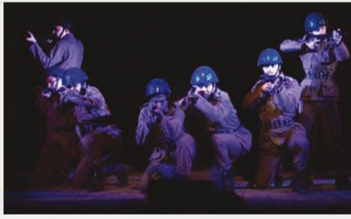
A scene from the play "Fona".

The Daily Star was media partner of the festival.