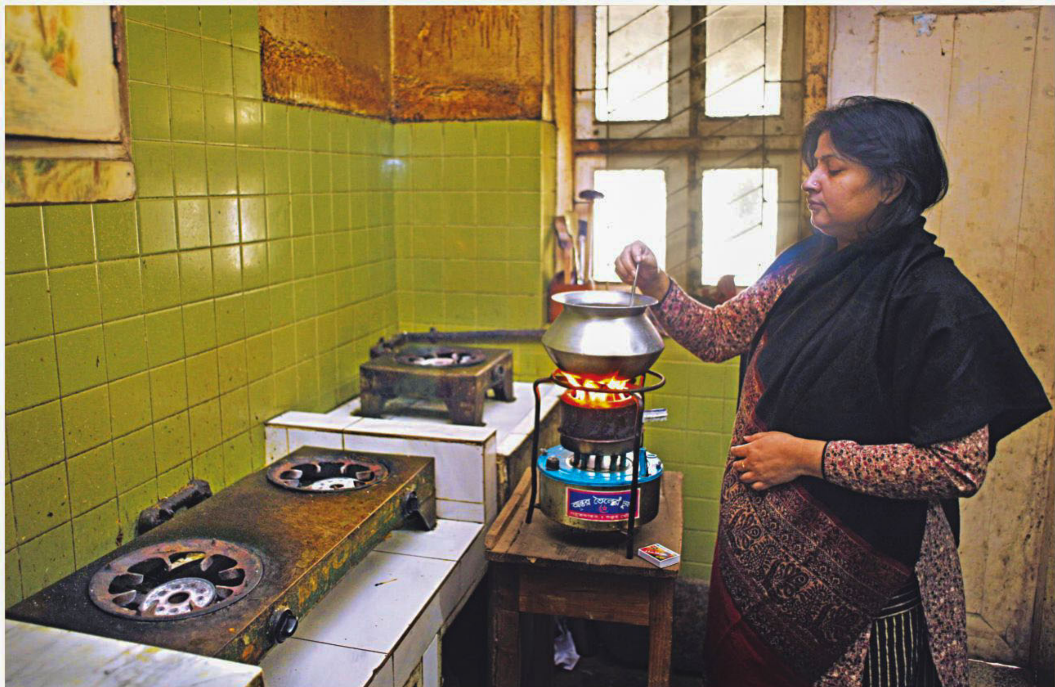
A woman cooks on a kerosene stove at her house in Rampura as she cannot use the gas burners due to an inadequate gas supply, a crisis that has plagued many areas in the capital since the winter set in. The photo was taken around noon yesterday.

Some CNG stations remain shut for 5-10 hours a day