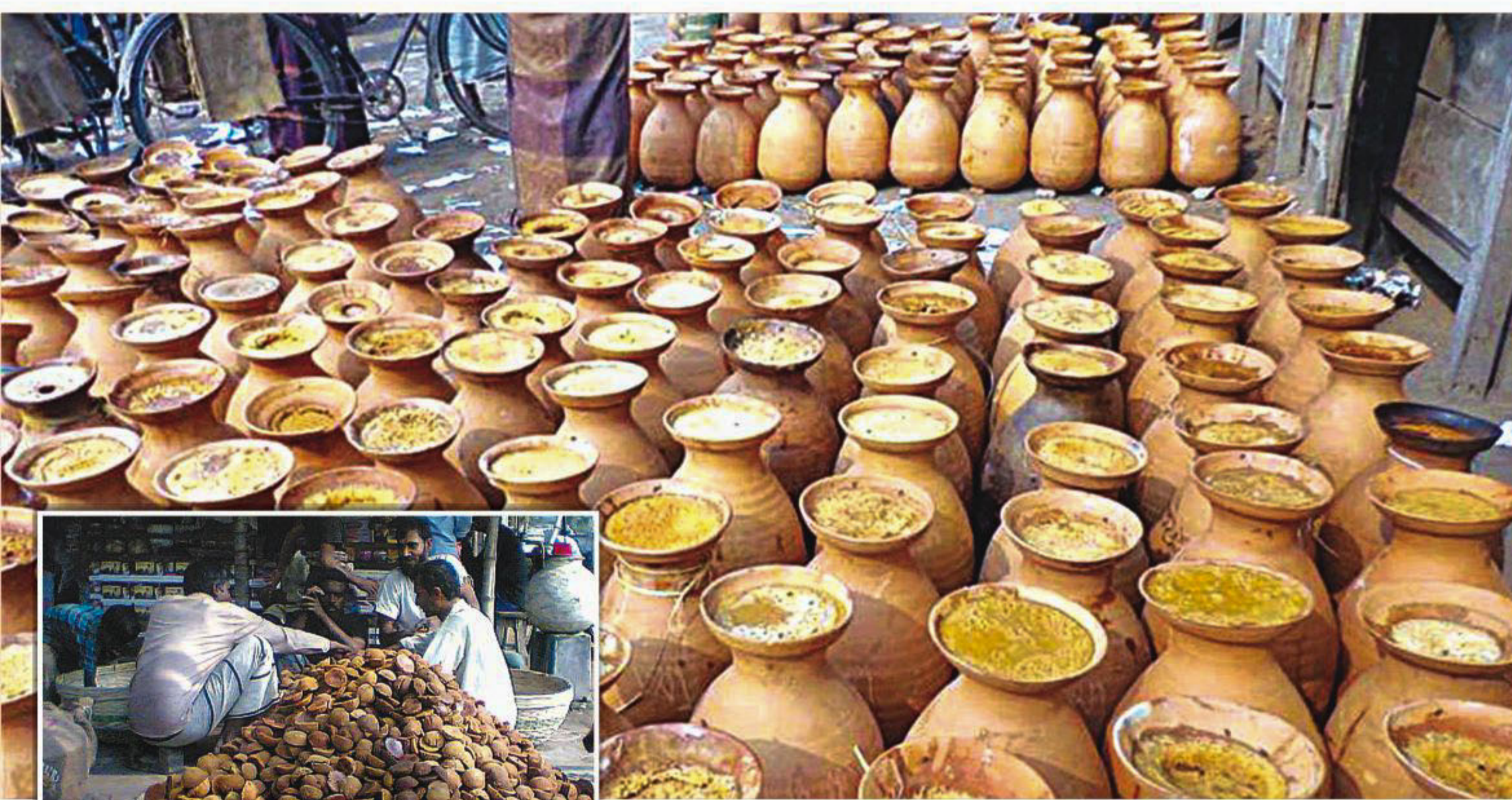
Earthen pots containing khejurer gur, a popular molasses made from palm tree juice. Makers of molasses in Jhenidah, which is famous for its khejurer gur, are passing busy days as demand rises sharply in winter. Inset, crystallised form of this molasses, known as patali, being sent to other districts.

AFP, Davos The world must act quickly to avert a future in which autonomous robots with artificial intelligence roam the battlefields killing humans, scientists and arms experts warned at an elite gathering in the Swiss Alps. Rules must be agreed to prevent the SEE PAGE 11 COL 4