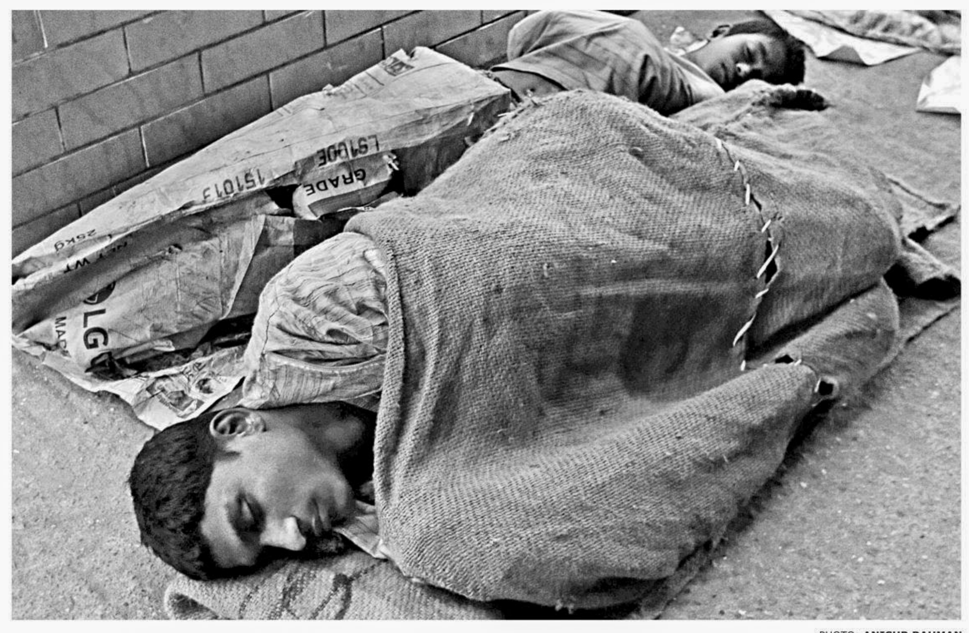
In the biting cold of yesterday's windy night and amidst the blurring brightness of flashing neon advertisement lights of the capital, two homeless persons in Kawran Bazar make their bed on a cold street and fall into a deep slumber wrapped up in jute sacks and plastic sheets.

Mahbub said there has been a conspiracy for a long time to split BNP but no one would be able to do so if its workers follow the ideals of Ziaur Rahman.