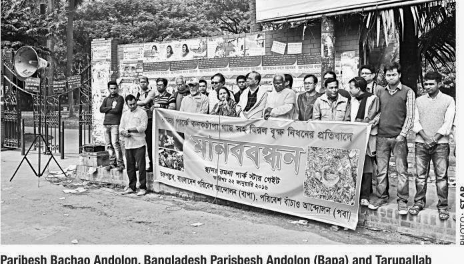
Paribesh Bachao Andolon, Bangladesh Paribesh Andolon (Bapa) and Tarupallab form a human chain before the Star Gate of Ramna Park in the capital yesterday, protesting the cutting of rare and uncommon trees like Kanakchanpa, Mamia, Agor, Kyashia Grandis, Sultanchanpa, Dulichanpa, Neelmonilota and many others.