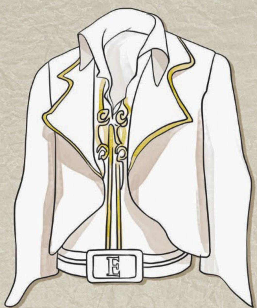
ILLUSTRATION: JUNAID DEEP