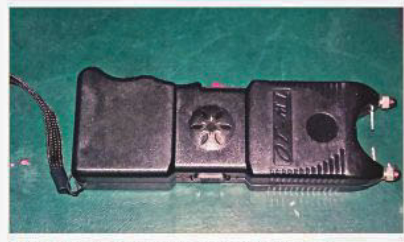
The stun gun, an electroshock weapon, seized in Chittagong.

FROM PAGE 16 Intelligence and Investigation Directorate. Representatives of intelligence and law enforcement agencies, after examining the device (stun gun), confirmed that it is a high-tech defense weapon, he said.