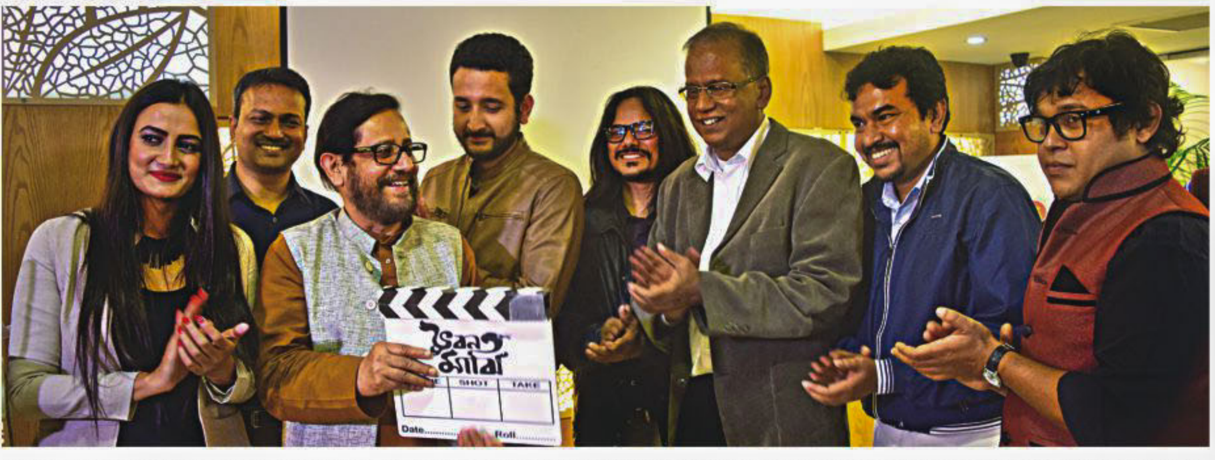
Lead actors and director of the film pose for a photo with Cultural Affairs Minister Asaduzzaman Noor, Nasiruddin Yousuff and other distinguished guests at the mahurat.