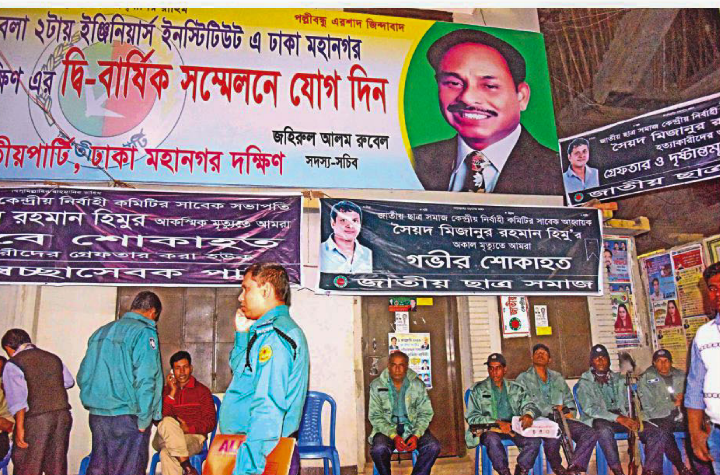
Security is stepped up in front of the city office of Jatiya Party yesterday evening, a day after the party was hit by a crisis over leadership dispute.