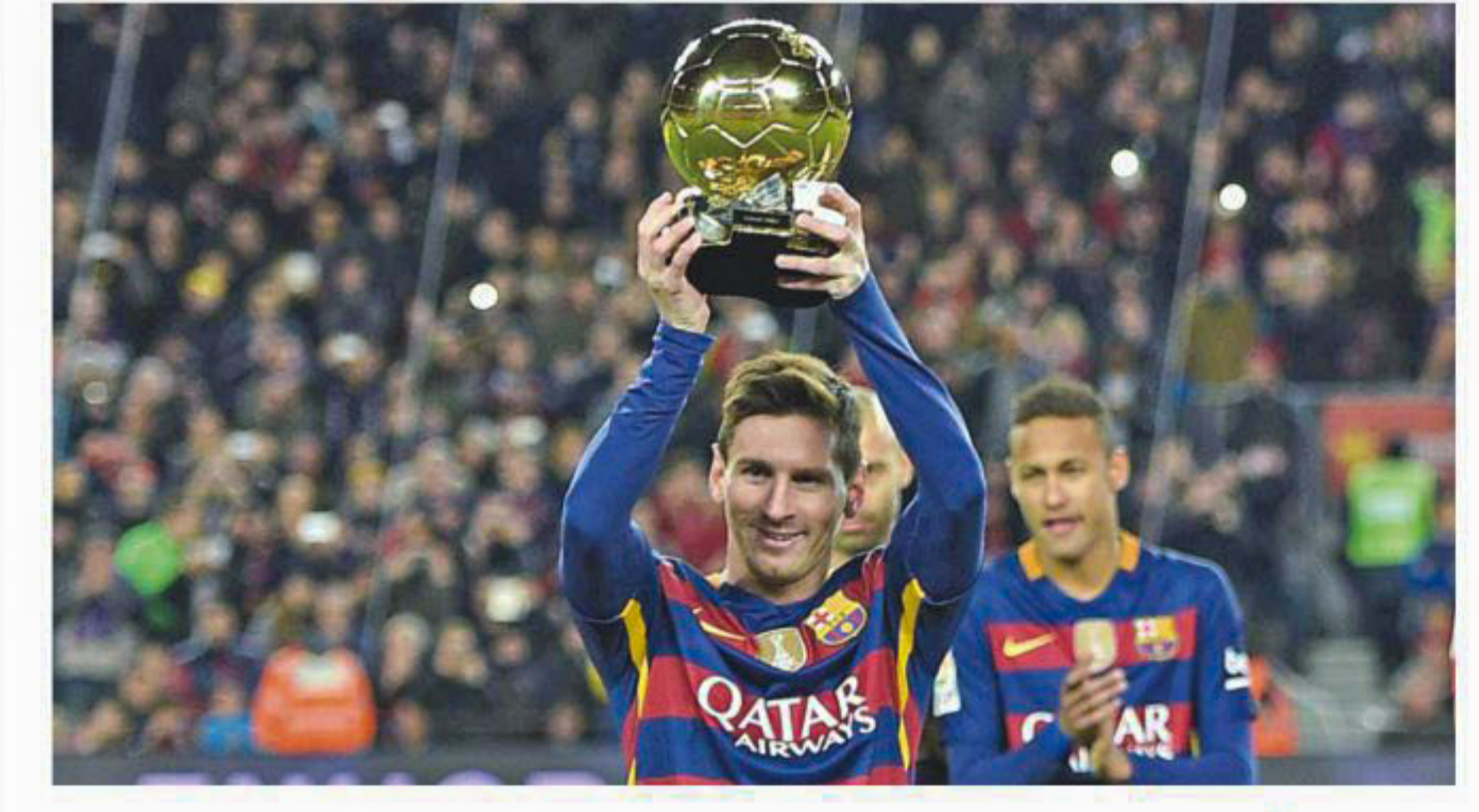
Barcelona superstar Lionel Messi holds up his fifth Ballon d'Or trophy before their Primera Liga match against Athletic Bilbao at the Nou Camp on Sunday.