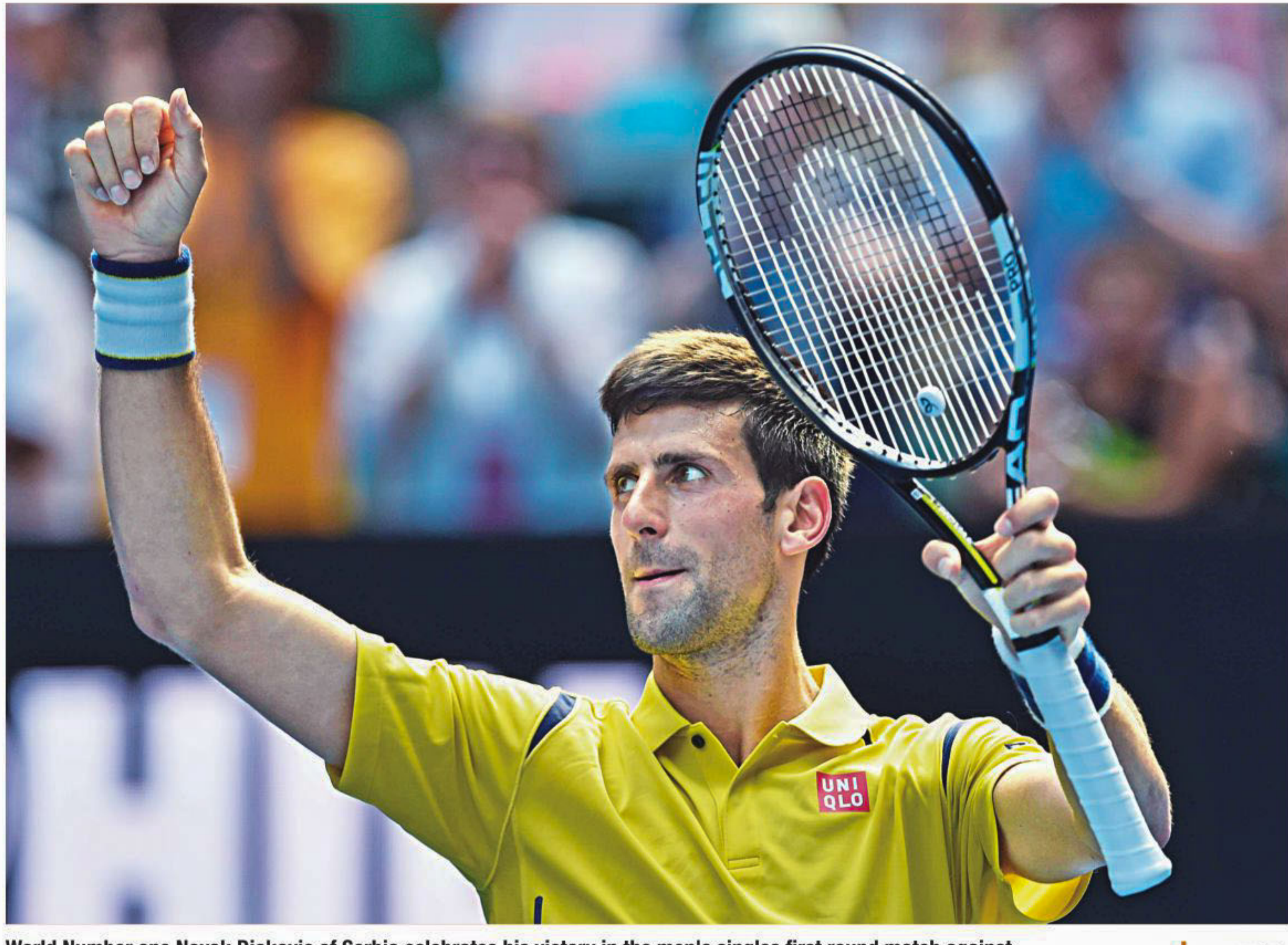
World Number one Novak Djokovic of Serbia celebrates his victory in the men's singles first round match against South Korea's Chung Hyeon during the Australian Open in Melbourne yesterday.

Canada's Eugenie Bouchard safely reached the second round, and Spain's Carla Suarez earned applause when she helped a ballboy from the court as he swooned in high temperatures.