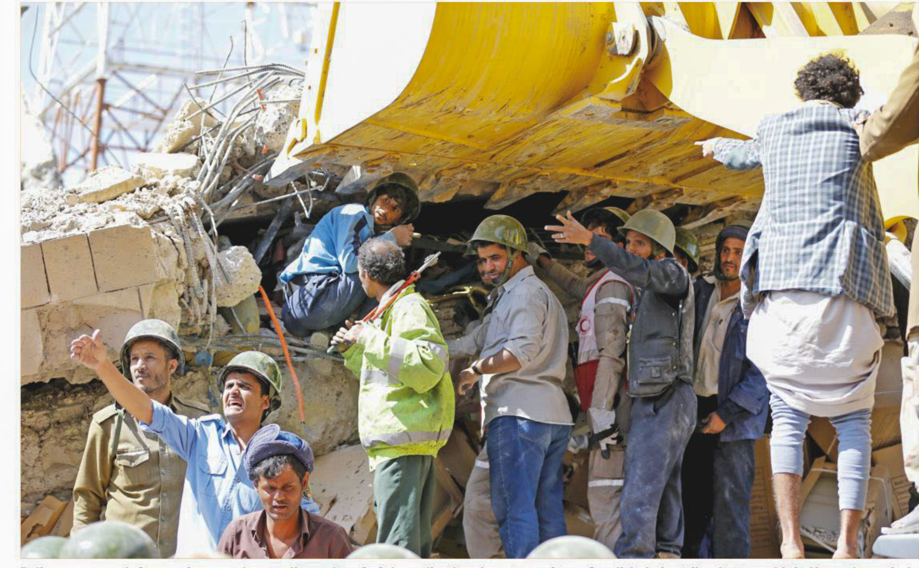
Policemen search for survivors under a collapsed roof of the police headquarters after a Saudi-led air strike destroyed it in Yemen's capital Sanaa yesterday. At least 30 people have been killed and wounded in the strike, a source in the emergency services said.