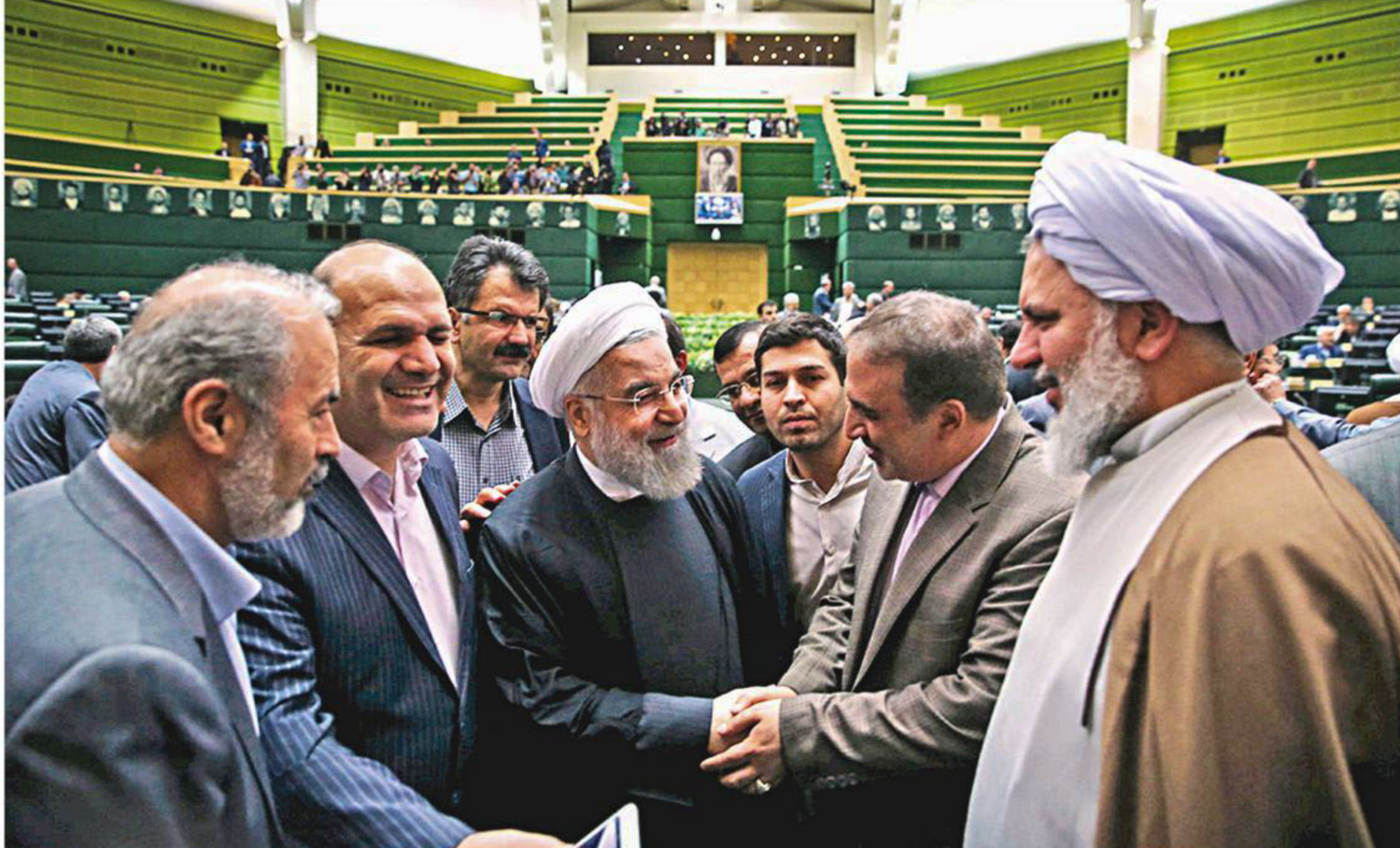
Iranian President Hassan Rouhani (C) is greeted during a session at the Iranian parliament to present the draft budget for the next Iranian fiscal year in Tehran yesterday. Iran has "opened a new chapter" in its ties with the world, Rouhani said, hours after sanctions were lifted under its historic nuclear deal with global powers.

The criminal networks stretch from sub-Saharan Africa to Scandinavia, with tens of thousands of people involved in the trade. Wainwright said that Europol identified 10,700 suspects last year alone, hinting at the scale of the illicit enterprise. The facilitators range from petty criminals, making fake passports, to taxi drivers taking migrants across countries and over borders, to established organised crime syndicates.