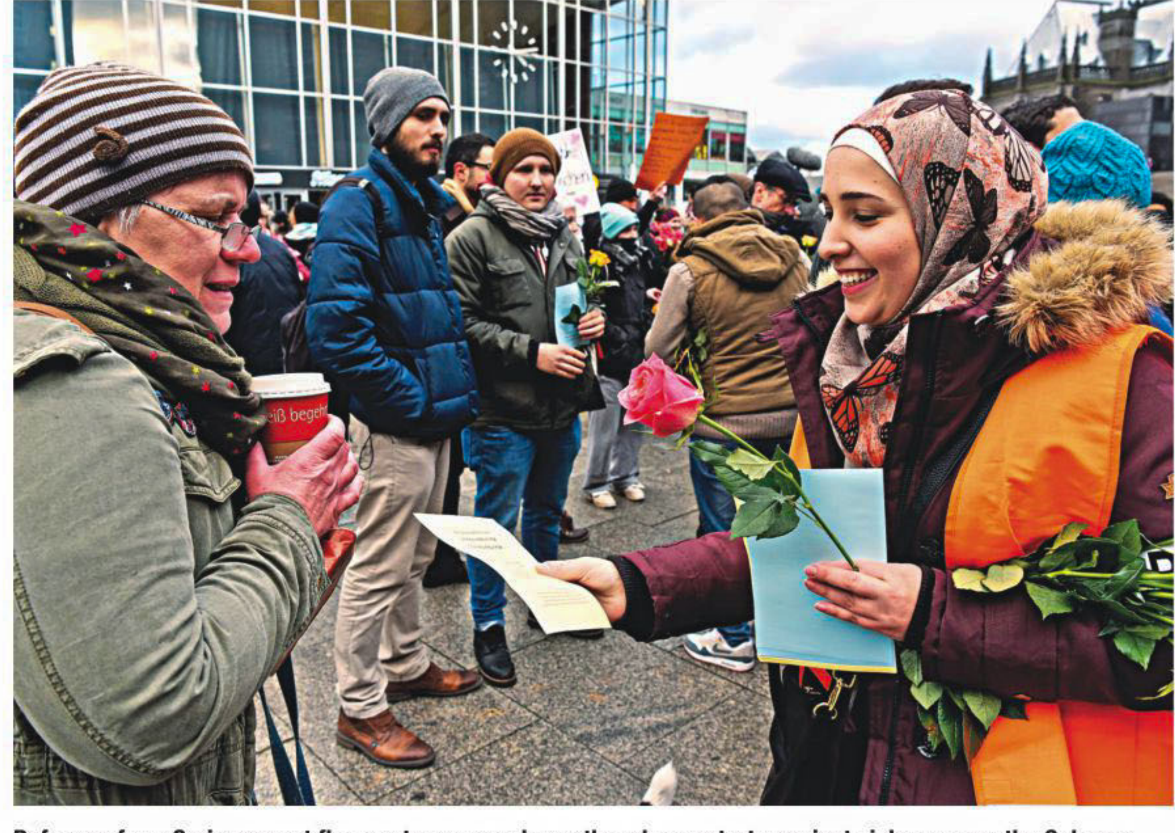
Refugees from Syria present flowers to passers-by as they demonstrate against violence near the Cologne main train station in Cologne, western Germany on Saturday, where hundreds of women were groped and robbed in a throng of mostly Arab and North African men during New Year's festivities.

"If there is no peace and stability in the Taiwan Strait, Taiwan's new authority will find the sufferings of the people it wishes to resolve on the economy, livelihood and its youth will be as useless as looking for fish in a tree," it said.