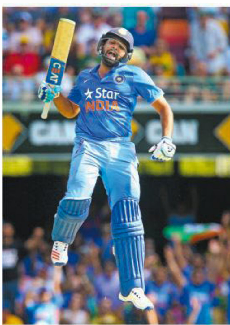
Indian opener Rohit Sharma jumps for joy after scoring his second consecutive hundred.