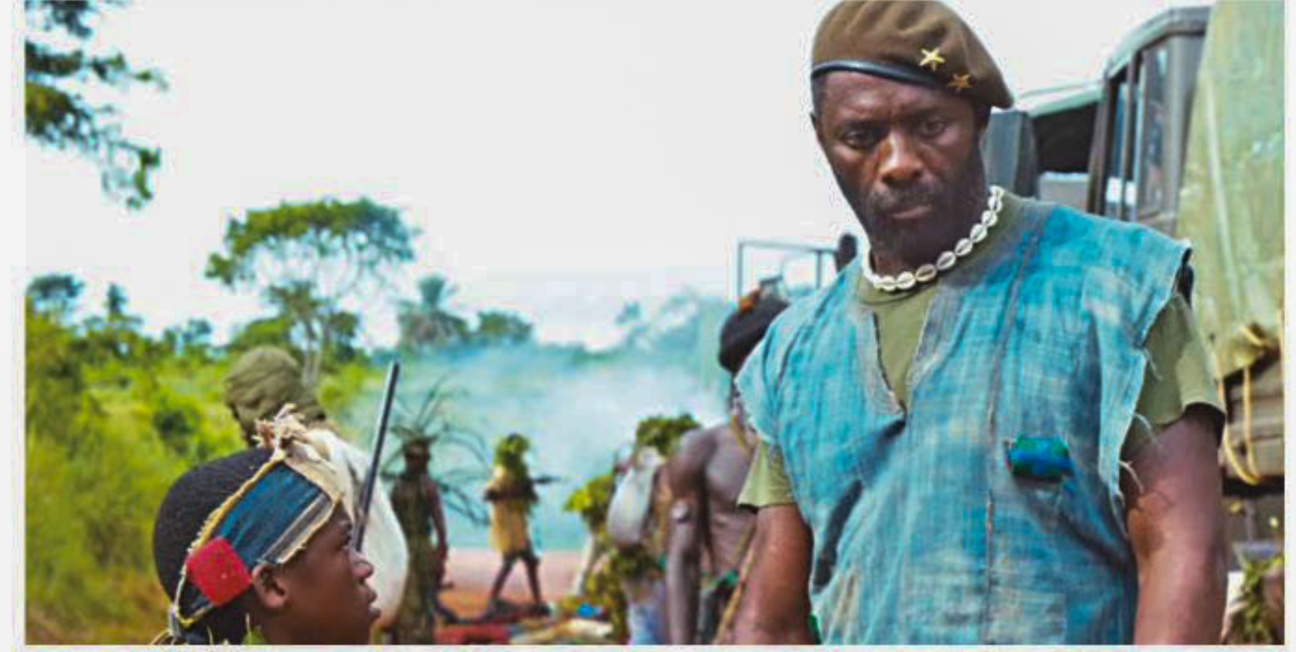
Idris Elba in "Beasts of No Nation"; he was one of the bigger actors of colour left out of the nods.

With such a crowded field for this year's Oscars race, there were bound to be big curveballs from the Academy Awards nominations on Thursday morning. But the most disappointing outcome is that, for the second consecutive year, all 20 of the acting nominees are white. "The Revenant" led all films with 12 nominations, closely followed by 10 nominations for "Mad Max: Fury Road." Here are the biggest snubs from this year's nominations. "Star Wars: The Force Awakens" Nominating the most gigantic movie in history (with a domestic box office tally of $820 million and growing) for best picture would have ensured that the Oscars telecast received a big boost in viewership. But the latest installment of "Star Wars" only picked up five nods in the technical categories like sound and editing. Ridley Scott, "The Martian" Scott was expected to win the best director category this year for his ambitious space epic starring Matt Damon. But like Ben Affleck for "Argo", the director's branch of the Academy overlooked him. However, he is nominated for best producer since "The Martian" was recognised in the best picture race. Idris Elba, "Beasts of No Nation" Elba was expected to be included in the best supporting actor category for portraying the commandant in Cary Fukunaga's drama set in West Africa. Although "Beasts" received a SAG ensemble nomination, and had strong support from within the