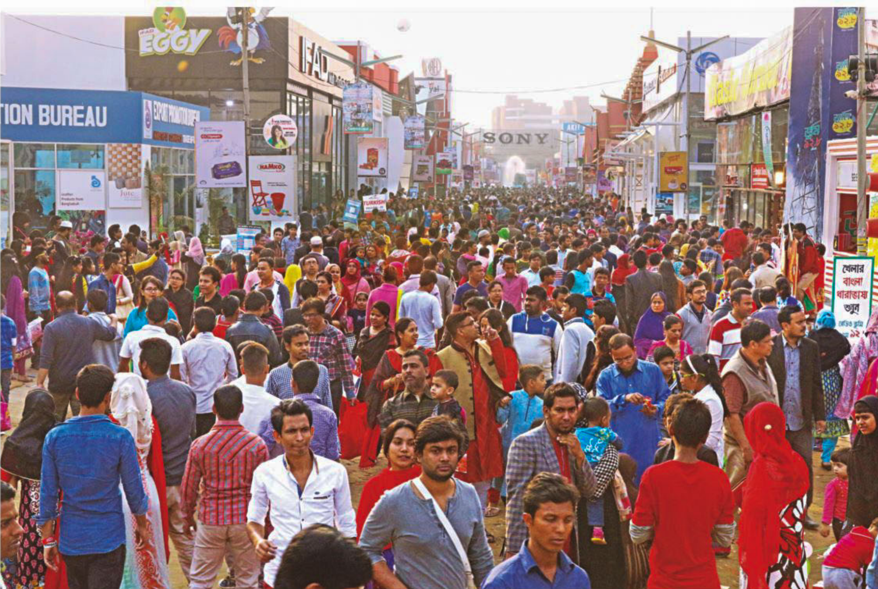
Dhaka International Trade Fair sees a huge crowd on the weekend yesterday, the 15th day of the month-long event.