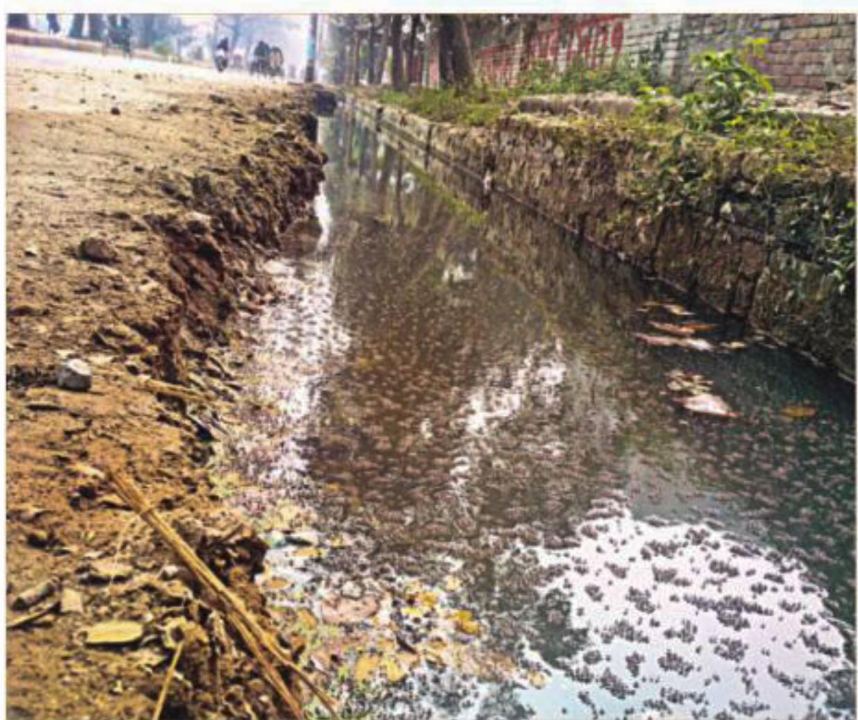
A drainage canal in the capital's Nikunja-2 has turned into a fertile ground for mosquito breeding. The photo was taken last week.

In Gendaria, the lone pond has its surface covered